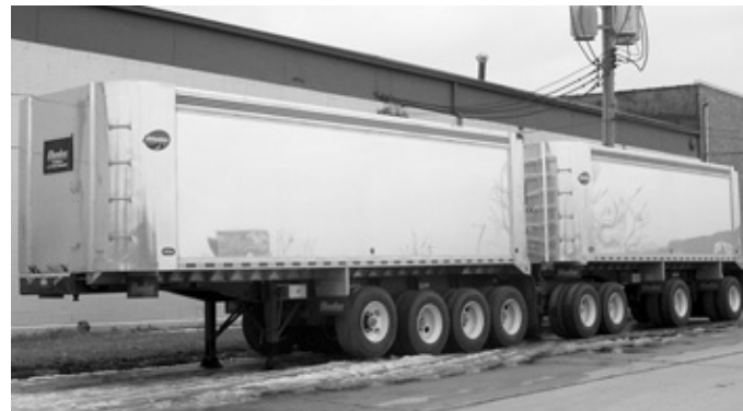
Order your set for this Spring now!

Our Latest Design For An Extra-Wide Interior.