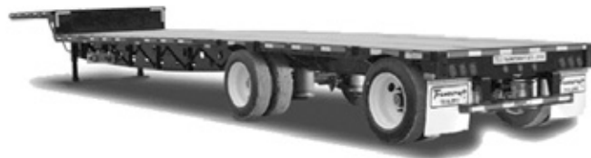
'12 Transcraft DTL-2100 53' steel drop deck, alum. outer rail w/wood floor, spread tdm. set 30" ahead, (1) alum. tool box & winch track.