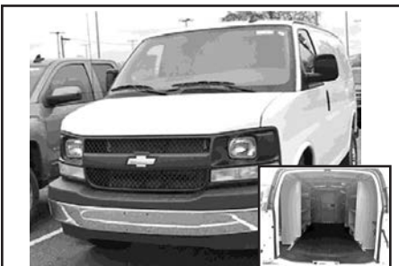
New 2017 Chevy Express 2500 cargo van, stock #571343, FREE ADRIAN STEEL BIN PACKAGE