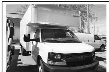
New 2017 Chevy Express, gas, 15' Rockport w/cabover, stock #572351, $38,995*