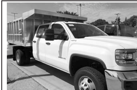
New 2017 Chevy 3500 HD Crew Cab, 12' alum. landscaper body w/knock-out sides, stock #575242, $53,995*