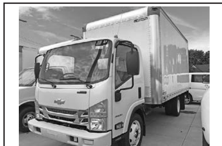
New 2016 Chevy LCF, gas, 16' Morgan van body, stock #564500