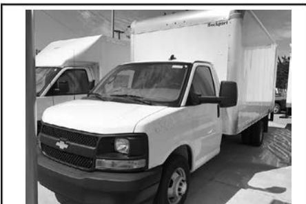
New 2017 Chevy Express, 16' Rockport van body, stock #572465

LEASE 48 Month, Unlimited Miles 993.52*/Month $993.52 Down Payment