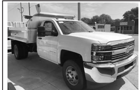
New 2017 Chevy 3500 HD, 11' stainless steel 3-4 yd. dump, stock #575914, $51,995*