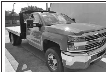
New '17 Chevy Silverado HD, 12' stake, stock #578119, $37,995*

LEASE 48 Month, Unlimited Miles $757.62*/Month $757.62 Down Payment