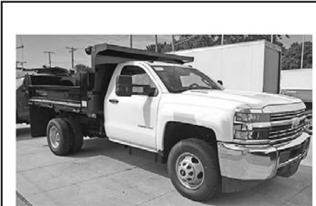
New 2017 Chevy 3500 HD, 11' dump body w/folding sides, stock #576083, $47,995*

Go to www.edrinke.com and select the Commercial Truck Tab to view more inventory!