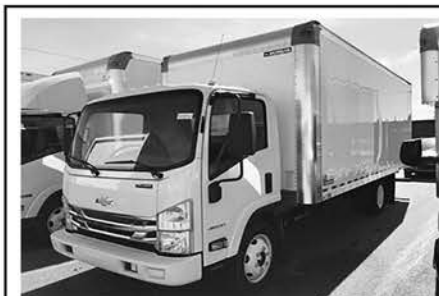
New 2016 Chevy 4500 LCF, gas, 20' ProScape landscaper box, stock #564574, $49,995*

LEASE 48 Month, Unlimited Miles $954.06*/Month $954.06 Down Payment