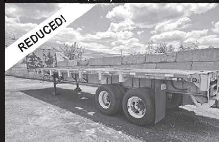
REDUCED! '07 Fontaine 36.5' flatbed trlr., tdm. axle, 22.5 hub pilot, tool box, sliding strap winches, steel bulkhead, log posts avail., $10,000 $9,500 or best offer.