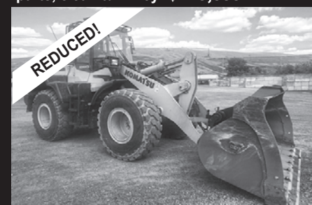
REDUCED! '22 Komatsu WA270-8 Idr., 3200 hrs., 4 spd. hydrostatic, JRB coupler, 3rd valve, includes 3.5 cu. yd. bucket, ldr. scales, CB, stereo, back up camera, all the bells & whistles! $165,000.