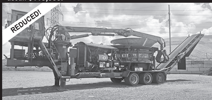
REDUCED! '02 Morbark 1200XL tub grinder, 11,200 hrs., Cum. QSK-19, 750 hp, new mill & mill bearings, new belt, 350 Morlift self-loading grapple, heat, A/C, CB, autofeed, reversing fan, all extra screens & parts, clean turn-key! $210,000.