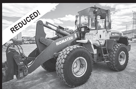
REDUCED! '08 Komatsu WA250PZ-6 Idr., 14,600 hrs., 4 spd. hydrostatic, JRB coupler, includes 3.5 cu. yd. bucket, 3rd valve, A/C, CB, stereo, any extra parts, $59,000.