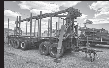
'83 O'Brien 25' 5-axle log pup, (1) lift axle, Hawk 1200 self-loading log crane w/brand new Serco continuous rotation grapple, 3-line wet kit, $20,000 or best offer.