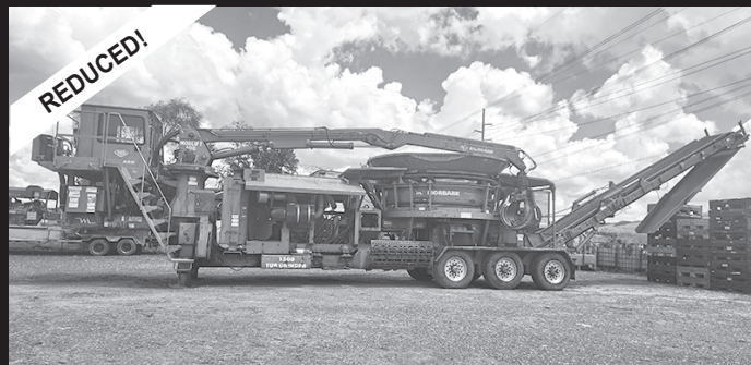
REDUCED! '14 Morbark 1300B tub grinder, 2nd owner, 8700 hrs., Cat 3412, 1050 hp, hydraulic PT Tech clutch, 400 Morlift self-loading grapple, heat, A/C, stereo, CB, autofeed, remote control, reversing fan, extra screens & parts, $450,000.