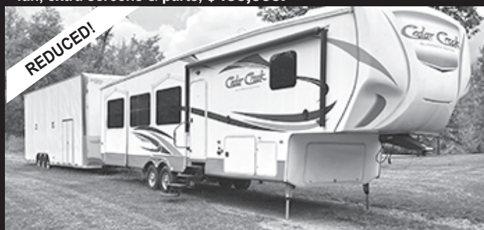
REDUCED! '17 Cedar Creek 37RL 5th whl., (5) slides, all the bells & whistles, king bed, washer & dryer, lots of storage, big kitchen - too much to list!! $36,000 or best offer.