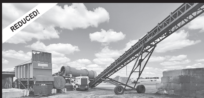
REDUCED! '08 Color Trom 250 by Amerimulch Co., 2nd owner, complete color plant, 25-yd. hopper, 85' radial stacker, paint mixer & scales, 250 yds. per hour, by far the best coloring system I have ever used!! $115,000.