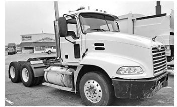
(3) '05-'06 Mack CXN613 , 350 hp, air ride, Choice $10,500.