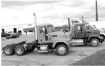
'06 Mack CHN613, 427 eng., 10 spd., (1) w/wet kit & lockers.