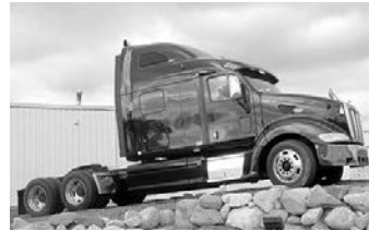
'09 Pete 387 , Cum. pwr., 10 spd., 12F, 40R, $24,500 .