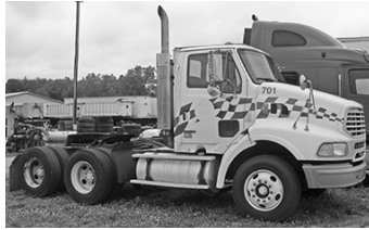
'03 Sterling , tdm. axle, day cab, C12/380 hp, 10 spd., 430,655 miles, air ride, $7,500 $6,500.