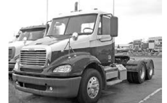
'09 FTL Columbia 112 , Cat C13, 350 hp, 10 spd. Autoshift, Jake, air ride, 22.5 tires, fleet maintained, great shape, $29,500 $29,000.