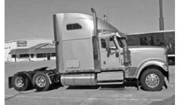
'09 Int'l. 9900/Eagle , Cum. ISX, 485 hp, 18 spd., 72" sky rise, Jake, air ride, 3.73 ratio, 246" WB, 709,000 miles, #0184, $37,500 $36,500.