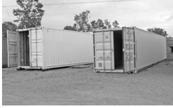
Shipping containers , 20' & 40', new & used, prices vary.