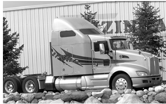
'10 KW T660, recent o'haul, 13 spd., 425 Cum., 3.55 ratio, 22.5 tires, 712,000 miles, $48,000.