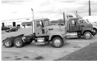
'06 Macks , 427 eng., 10 spd., (1) w/ wet kit & lockers.