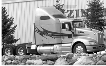
'10 KW T660 , recent o'haul, 13 spd., 425 Cum., 3.55 ratio, 22.5 tires, 712,000 miles, $52,500 .