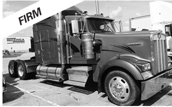
'04 KW W900L , Cum. ISX, 450 hp, 60" slpr, 10 spd., Jake, air ride, very clean, alum. whls., #0156, $32,900 $30,000.