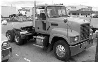
'06 Mack CHN613 , Mack E7, 10 spd., Jake, air ride, wet kit, dbl. lockers, 182" WB, 12F, 40R, #0122, $39,900 $38,900.