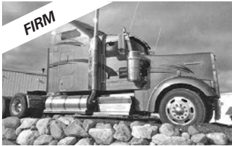
'04 KW W900L , Cum. ISX, 450 hp, 60" splr., 10 spd., Jake, air ride, very clean, alum. whls., #0156, $32,900 $30,000.