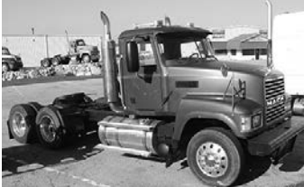
'06 Mack CHN613 , Mack E7, 427 hp, 10 spd., dual chrome stacks, good shape, runs great, #0128, $31,500 $30,000.