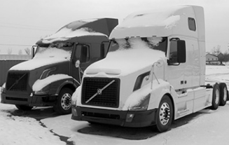
(3) '07 Volvos, 10 spds., 12F, 40R, D12 Volvo dsl., 850,000 to 950,000 miles, well maintained, $14,000.