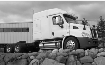
'10 FTL Cascadia 125 , Mercedes 450 hp, Autoshift, 65" mid-roof, 230" WB, 3.55 ratio, 705,000 miles, $10,000 just spent on eng. w/receipts avail., $29,900 .