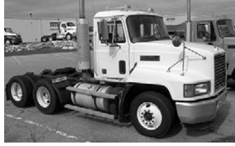
'01 Mack CHN613 , air ride, 10 spd., one-owner, 786,000 miles, $8,900 .