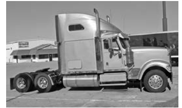
'09 Int'l. 9900i Eagle, Cum. ISX, 485 hp, 18 spd., 72" sky rise, Jake, air ride, 3.73 ratio, 246" WB, 709,000 miles, #0184, $37,500 $36,500.