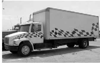
'03 FTL FL70, Cat dsl., 6 spd., 26' van, side door, R.U. door, runs & drives well, new injectors, A/C runs cold, 645,715 miles, $8,500.