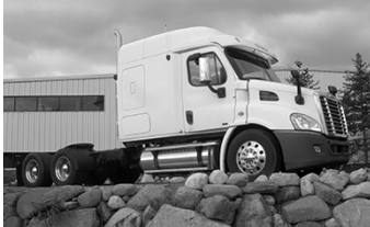
'10 FTL Cascadia 125, Mercedes 450 hp, Autoshift, 65" mid-roof, 230" WB, 3.55 ratio, 705,000 miles, $10,000 just spent on eng. w/receipts avail., $29,900.