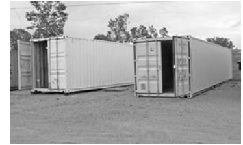
Shipping containers , 20' & 40', new & used, prices vary.