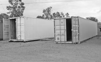
Shipping containers , 20' & 40', new & used, prices vary.