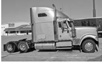
'09 Int'l. 9900/Eagle , Cum. ISX, 485 hp, 18 spd., 72" sky rise, Jake, air ride, 3.73 ratio, 246" WB, 709,000 miles, #0184, $37,500 $36,500.