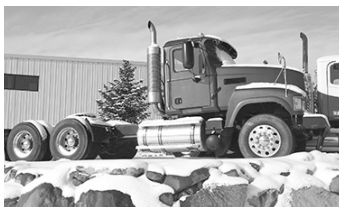
'06 Mack CHN613, Mack E7-427, 10 spd., no rust, Texas truck, air ride, 12F, 40R, 4.10 ratio, eng. brake, $29,900.