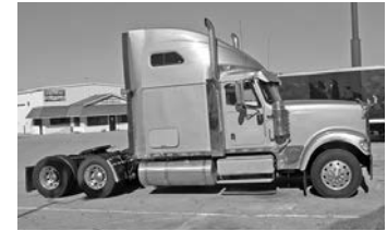
'09 Int'l. 9900i Eagle , Cum. ISX, 485 hp, 18 spd., 72" sky rise, Jake, air ride, 3.73 ratio, 246" WB, 709,000 miles, #0184, $37,500 $36,500 .