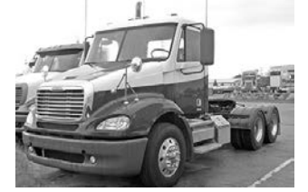
'09 FTL Columbia 112 , Cat C13, 350 hp, 10 spd. Autoshift, Jake, air ride, 22.5 tires, fleet maintained, great shape, $29,500 $29,000.