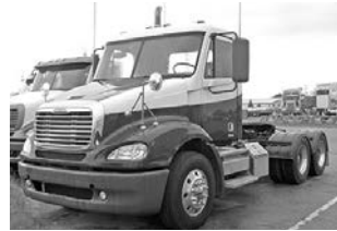
'09 FTL Columbia 112 , Cat C13, 350 hp, 10 spd. Autoshift, Jake, air ride, 22.5 tires, fleet maintained, great shape, $29,500 $29,000 .