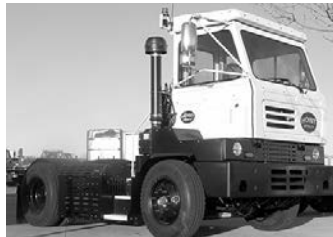
New '18 Hoist , T-Series switchers, Cum. pwr., Allison auto., in stock, call.