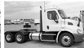
'16 FTL Cascadia 113 , Det. Dsl. DD13, 470 hp, 10 spd., air ride susp., tdm., eng. brake, 3.42 ratio, 22.5 tires, alum. whls., 186" WB, #107654, $79,900.