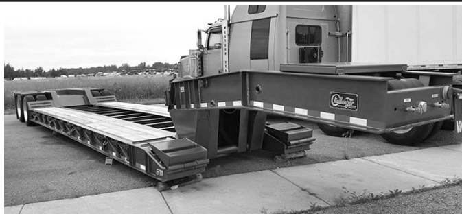
'18 Witzco Challenger NGB40 , 24' load well, 80,000# cap., LED lights, alum. whls., 10 hp pony motor, $41,500 + F.E.T.