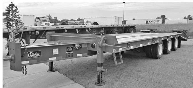
'18 Witzco Challenger TT25 , 50,000# cap., 22'6" deck, liftable frt. axle, folding ramps, $26,250 + F.E.T.