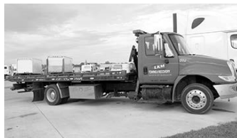
'08 Int'l. 4300 , 230 hp, Allison auto., 21' Champion steel bed, side puller, 158,000 miles, whl. lift, A/C, pwr. windows, pwr. locks, alum. whls.