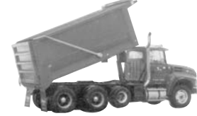
Tri-axle dump truck, set up w/rock boxes.