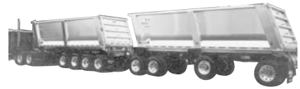
Super train, all alum. whls., 30,000#.

ALUMINUM REPLACEMENT BODIES - ALL SIZES - CALL FOR PRICING!