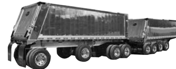
Super train, all alum. whls., 30,000#.