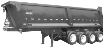
Rhodes Radius steel quad, hitch & lines to rear.