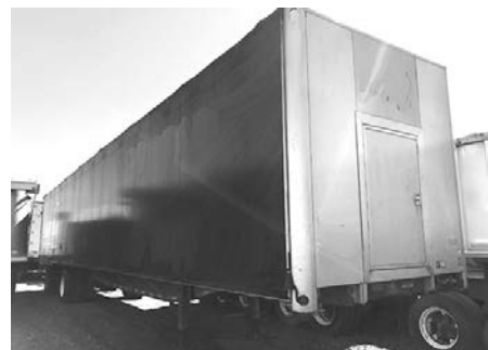
(2) '11, (3) '12 & (3) '14 Utility 53'x102" combo flats , w/Quickdraw curtain, air ride spread, must see cond.