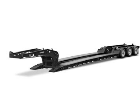
(2) '21 Fontaine Heavy Hauler 55LCC , in stock, 4th flip axle also in stock.