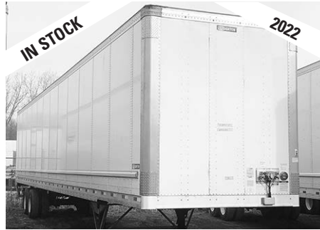
(75) New Stoughton 53' air ride Z-plates , exterior rub rails, PSI tire inflation system, Diamond plate ft. corners.