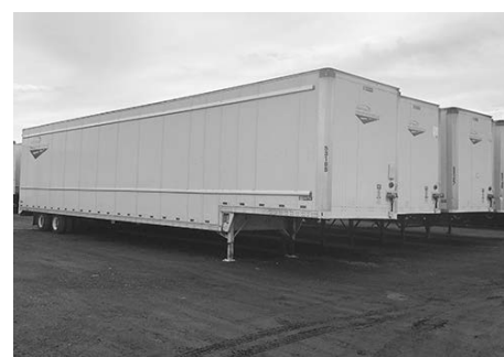
(1) '15 & (1) '16 Stoughton 53' Z-plate drop , many extras!