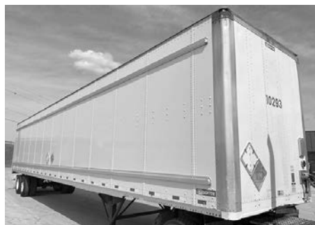
(6) '09 Auto Spec Stoughton Z-Plate , 3-11's, call for pricing!