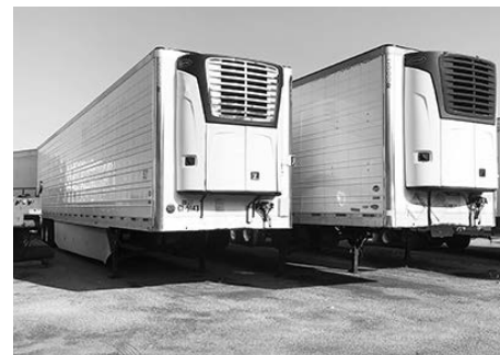
'14 Utility 53' reefer , Vector unit, CLEAN!