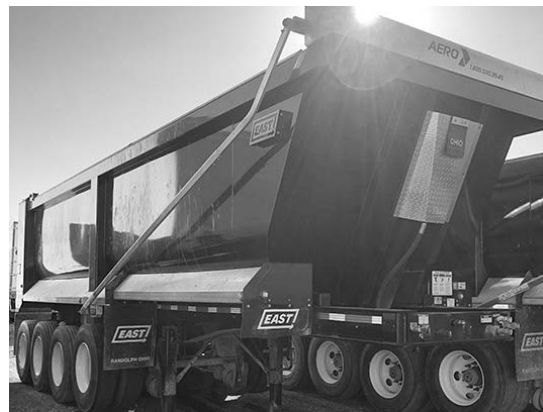
(2) '21 East AR450 steel quad , air assist gate, elec. mouse trap tarp, hurry, won't last.