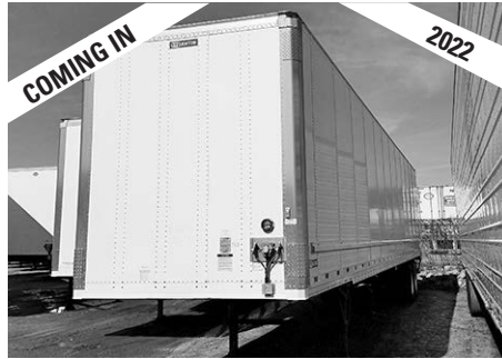
(100) Stoughton 53' Z-plates , air ride, ext. rub rail, corrugated steel in roof.