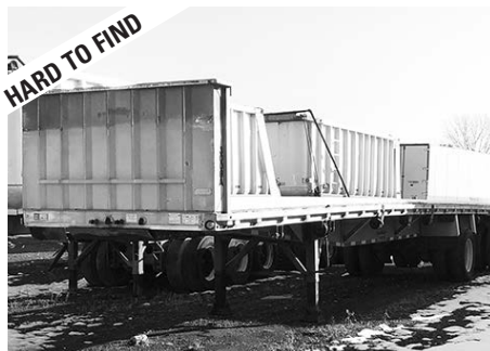
'06 Reitnauer 45' all alum. flat , READY TO ROLL!