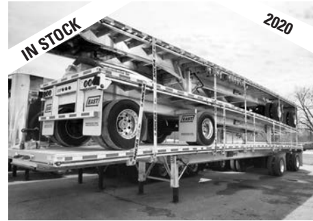
'20 East 48' all alum. spread axle , air ride, spread axle, alum. whls., J-hooks, in stock. PRICED TO MOVE!