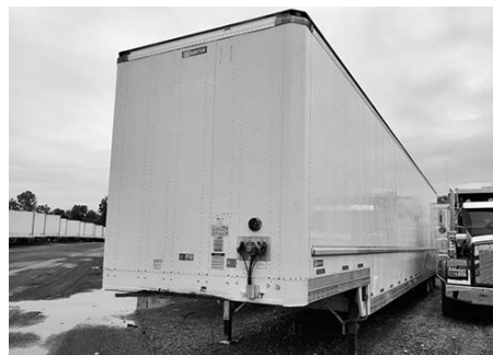
(2) '12 & (1) '15 Stoughton 53' drop , must see cond.