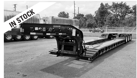
(2) New '19 Fontaine 55-ton lowboy.