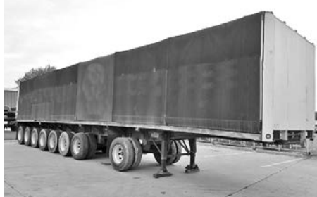
'01 Thruway 50' 8-axle, all air ride, (4) lifts, call for price.