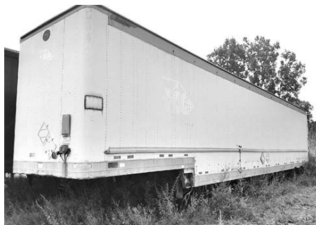
(5) 53' Drop frame , various models, great for storage.