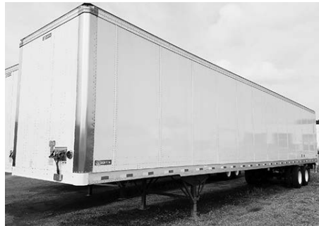
'19 Stoughton Z-plates , spg. ride susp.