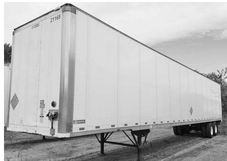
(6) '12, (9) '14, (9) '15 Stoughton Z-plates , (1) w/ext. rub rail & tire inflation, coming in January.