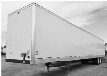
New '20 Utility 4000DX, 53'x102" , call for price.