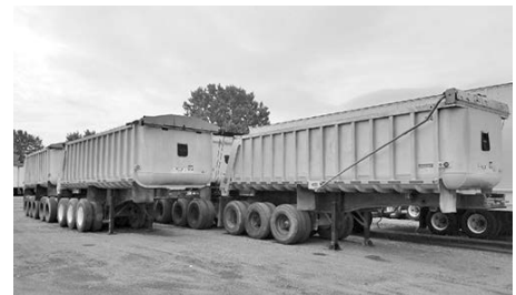
(2) '95 Fruee. alum. train, ready to work, call for price.