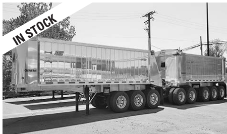
(6) New '20 East Genesis alum. train, alum. frame & whls., call for pricing. Also: Air ride & disc brakes.