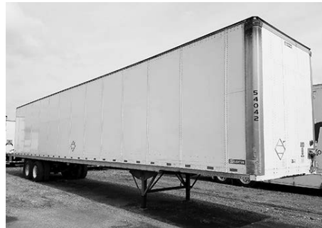
'12 Stoughton 53' Z-plate , air ride, call for pricing.