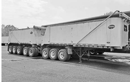
'08 Rhodes alum. trlr., ready to work, been through the shop!