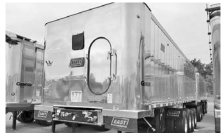
'20 East all alum. Super train, many options, call for price.