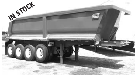
(6) New '19 East 28' AR450 steel quads, some w/air assist gates, in stock now, call for pricing.