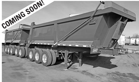
'20 East AR450 steel train, gates, alum. whls., mouse trap tarp.

Visit Us On The Web @ lakeshoreutility.com