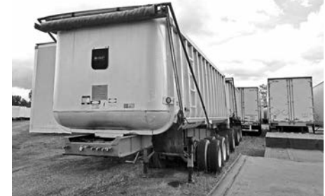
'96 Fruee. alum. train, mouse trap tarps, call for special pricing.