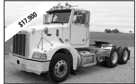
'03 Pete 385, Cat C12, 400 hp, 10 spd., 12F, 40R, air ride, alum. frt. whls., good rubber, priced to sell, stk. #1600.

WE FINANCE TRUCKS - CALL US FOR DETAILS • OUR TRUCKS ARE PRICED UNDER THE MARKET