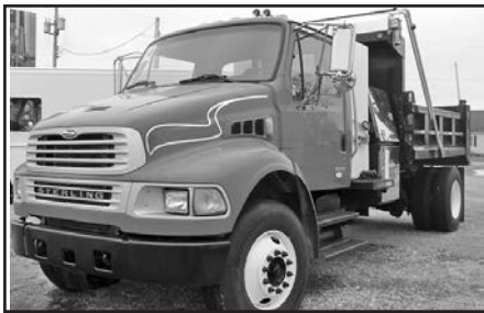
'04 Sterling dump w/l-Pac & water tank, Cat 230 hp, 6 spd., 12F, 21R, 33,000 GVW, air brakes, 10' dump w/elec. tarp, stk. #1671.