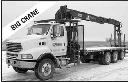
'06 Sterling dry wall boom truck, Mercedes 410 hp, 10 spd., 20F, 40R, TufTrac susp., 24' bed w/Hiab crane, 217,000 miles, stk. #1649.