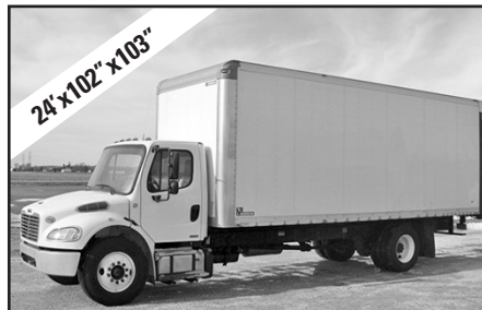
'12 FTL M2 box truck, Cum. 6.7L, 250 hp, Allison auto., 12F, 21R, 33,000 GVW, air ride, air brakes, 200,000 miles, stk. #1669.