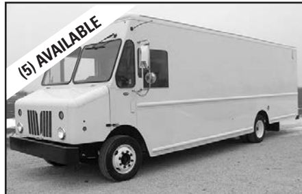
'09 Workhorse step vans, gas V8 8.1L, Allison auto., back up camera, 22' long w/ramps, 100,000-160,000 miles, stk. #1637.