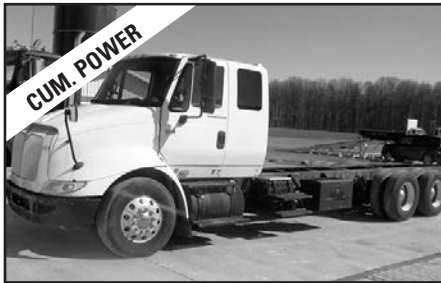
'07 Int'l. 8600 ext. cab tdm. chassis, Cum. ISM, 370 hp, 10 spd., 12F, 40R, dbl. frame, 540,000 miles, just arrived, stk. #1709.

WE FINANCE TRUCKS - CALL US FOR DETAILS • OUR TRUCKS ARE PRICED UNDER THE MARKET