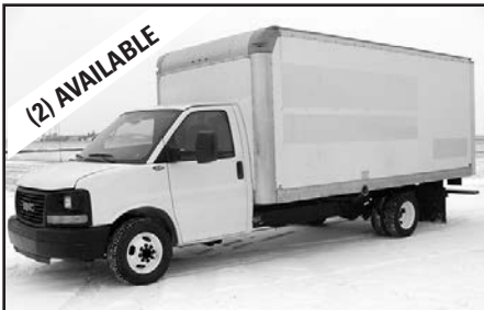
'11 GMC 3500 cube vans, gas V8, auto., 3rd person seating, 16' van body w/ramps, 150,000 miles, stk. #1704, asking $12,900.