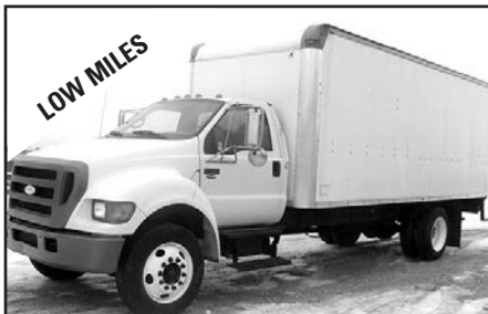
'07 Ford F750 box truck, Cum. 5.9L, 260 hp, Allison 3060P auto., 25,999 GVW, under CDL, 20' van body, will sell as chassis, stk. #1692.

WE TAKE TRADES OF ALL KINDS • WE NEGOTIATE PRICE - CALL & LET'S DEAL