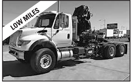
'05 Int'l. 7600 day cab w/knuckle boom crane, Cum. ISM 370 hp, 10 spd., 14F, 40R, air ride, Hiab 244XS crane, 280,000 miles, stk. #1623.