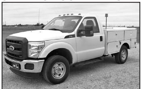
'11 Ford F350 4x4 service truck, gas 5.4L V8, auto., loaded w/windows, locks & cruise, 9' service body w/air compressor, stk. #1594.