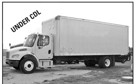
'06 FTL M2 box truck, Cat 210 hp, Allison auto., under CDL, 179,000 miles, 24' van body w/liftgate, stk. #1702.