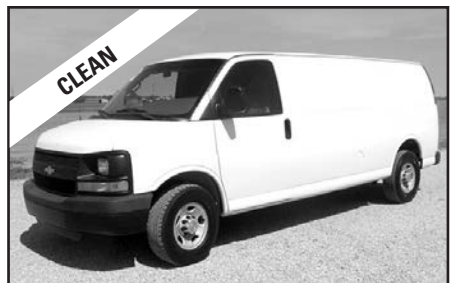
'12-'13 Cargo vans, 3/4 ton extended, gas V8, auto., loaded w/windows, locks & cruise, 68,000 & 118,000 miles, stk. #1661.

WE TAKE TRADES OF ALL KINDS • WE NEGOTIATE PRICE - CALL & LET'S DEAL