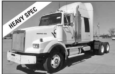
'05 Western Star 4900SA, w/removable splr., Det. 12.7, 455 hp, Allison 4500RDS auto., 18F, 46R, would make a great tri-axle dump, stk. #1700.