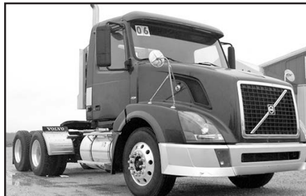
'06 Volvo day cab, Volvo 435 hp, 10 spd., 12F, 40R, 4.11 ratio, alum. whls., 630,000 miles, no rust, stk. #1473, asking $17,995.