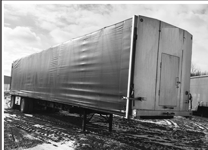
(1) '05 & (1) '06 Transcraft Conestoga, 48'x102", fixed spread, air ride, Roll Tight System.