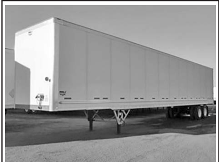
New '19 Wabash Duraplate, rub rail, air inflation, galvanized rear, CALL.