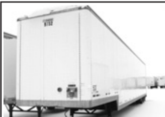
'00 Manac 53'x102" air ride, auto drop trlrs., 126" ins. ht., low deck ht., call for pricing.