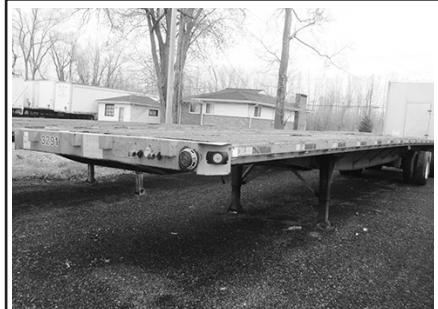
(2) '98 G/Dane flatbeds, 48'x102", air, $4,250.