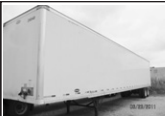
{6} (4) '06 & '07 Strick & Wabash 53'x102" air ride vans, available now!! Call for pricing.