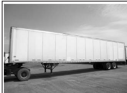
(20) '11 Wabash Duraplate, 53'x102", alum. roof.