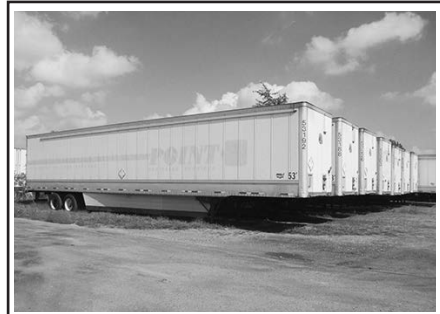
(27) '08 Wabash Duraplate HD, w/24" log. post, translucent roof w/protection, 22.5 LP tires, priced to sell, CALL FOR PRICING.