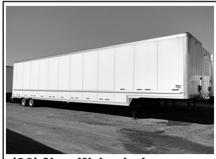
(20) New Wabash drop vans, 53'x102", 5-1/2" ride ht., lower rub rail, galv. rear, Michelin tires.