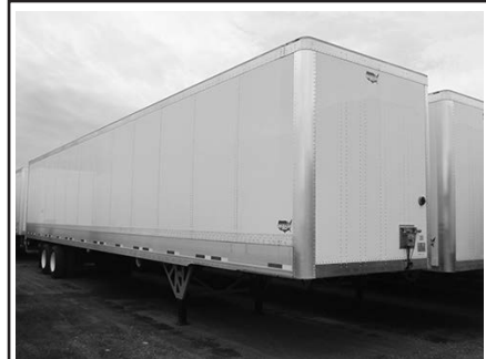
(5) New '18 Wabash HD, 24,000 floor rating, rub rail, air inflation, galv. rear, air ride, CALL!