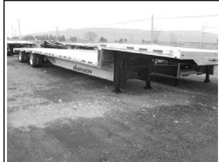
(2) '17 Benson 524A drop decks, 53'x102", aluim. storage box, rear axle sld., winch track, NICE! $38,995* INCLUDING F.E.T.!