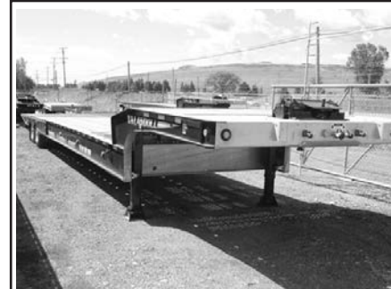
(2) New '17 Landoll 930D-51-15, GALVANIZED, wireless rem., 20,000# winch, keyhole center tie-downs, 6' upper deck ramp, steel traction plate over wood on tail.