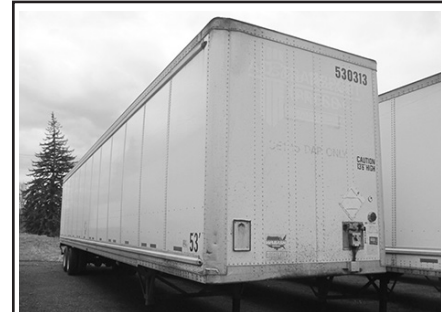
(5) '03 & '04 Wabash Duraplate, 53'x102", alum. roof, swg. doors, dbl. rub rail, air ride, CALL!