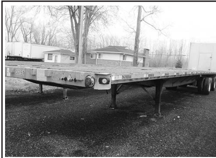
(2) '98 G/Dane flatbeds, 48'x102", air, $4,250.