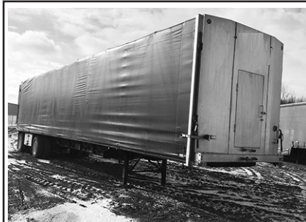
(2) Transcraft & (1) Fontaine Conestoga, 48'x102", fixed spread, air ride, RollTight System.