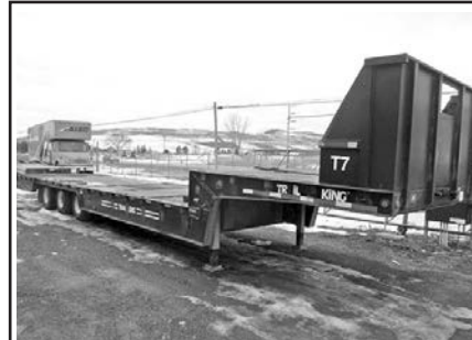
'05 Trail King 70HT, 3-axle, w/hyd. tail, bulkhead, traction plate, 20K winch.