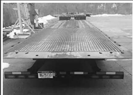
'07 Landoll 930, 20K winch, clean, CALL FOR PRICING.