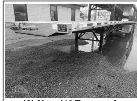
(3) New '19 Transcraft 554 combo 53'x102" flatbeds, CA legal, winch tracks, air inflation, alum. toolbox, tire carrier.

FULL TIME EXPERIENCED PARTS SALESPERSON WANTED FOR DETROIT AREA.