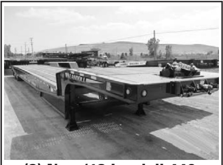
(2) New '18 Landoll 440, 53'x102", galv., 20,000 winch, wireless rem., alum. whls. & more, COMING SOON! CALL FOR PRICING!