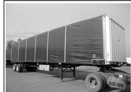
'05 Fontaine Conestoga, 48'x102", Aero Conestoga system, toolbox, Hutchens susp.