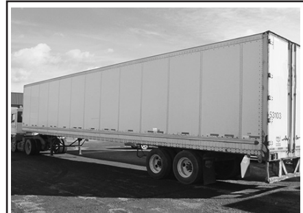
(30) '08 Wabash Duraplate HD, w/24" log. post, translucent roof w/protection, 22.5 LP tires, priced to sell, CALL FOR PRICING.