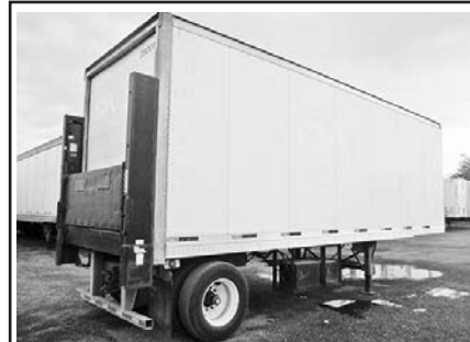
'05 T/M, 28'x102" pup, Maxon liftgate, 22.5 LP tires, air ride, alum. roof, CALL!