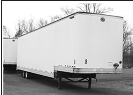
(4) '01 & '02 G/Dane drop vans, 53'x102", swg. door, air ride.