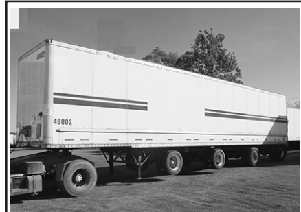
(4) '00 Wabash quad-axle vans, 48'x102", (2) lift axles, auto protection, 9' spread, air ride, CALL FOR DETAILS!