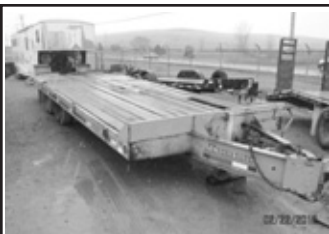
'96 Interstate, 20-ton tag equip. trlr., spg. susp., minor floor repair needed, $7,500.