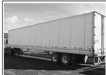
(38) '08 Wabash Duraplate HD, w/24" log. post, translucent roof w/protection, 22.5 LP tires, priced to sell, CALL FOR PRICING.