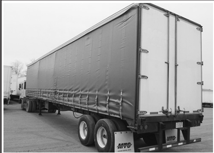
'06 Utility curtainside, 48'x102", air ride, 22.5 LP tires, priced to sell, $15,000

www.TNTtrailerSales.com Complete Inventory Online!