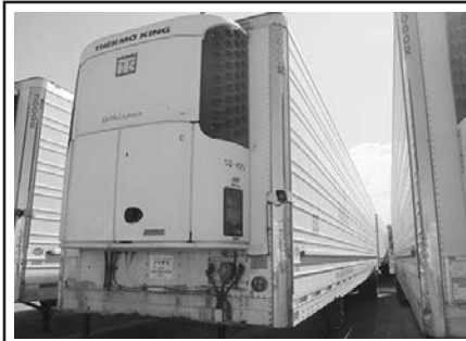
(1) '06 & (1) '08 Utility reefer trlr., TK unit, 53'x102", CALL FOR PRICING.