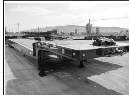
New '18 Landoll 440, 53'x102", galv., 20,000 winch, wireless rem., alum. whls. & more, COMING SOON! CALL FOR PRICING!