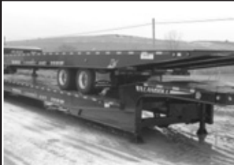
(2) New '12 Landolls coming in May, 53'x102", alum. whls., 20,000 lb. winch, wireless rem., central grease, container pkg. avail.