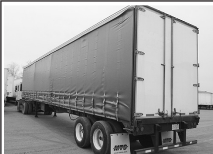
'06 Utility curtainside, 48'x102", air ride, 22.5 LP tires, priced to sell, $15,000