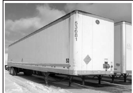
(2) '09 G/Dane, 53'x102" vans, air ride, alum. roof, CLEAN.