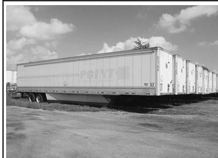
(11) '08 Wabash Duraplate HD , w/24" log. post, translucent roof w/protection, 22.5 LP tires, priced to sell, CALL FOR PRICING.