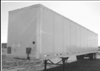
{5} (4) New '12 Wabash Duraplate vans, 53'x102", Turner air ride, galv. rears, alum. roof, LP 22.5 tires, call for pricing.

(734) 729-9700 • (888) 651-9423 VISIT OUR NEW LOCATION AT 5055 HANNAN RD., WAYNE, MI