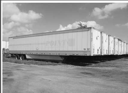
(16) '08 Wabash Duraplate HD, w/24" log. post, translucent roof w/protection, 22.5 LP tires, priced to sell, CALL FOR PRICING.