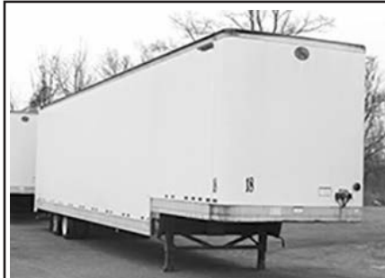
(4) '01 & '02 G/Dane drop vans , 53'x102", swg. door, air ride.