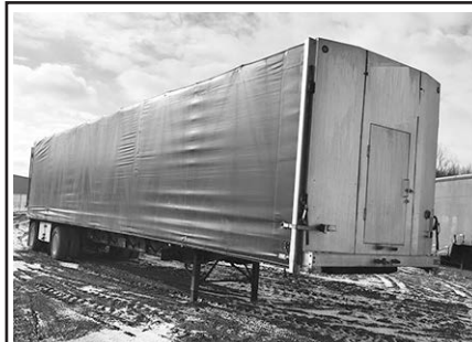
(1) '05 & (1) '06 Transcraft Conestoga , 48'x102", fixed spread, air ride, Roll Tight System.