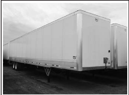
(9) New '18 Wabash H.D., 53'x102", rub rail, air inflation.