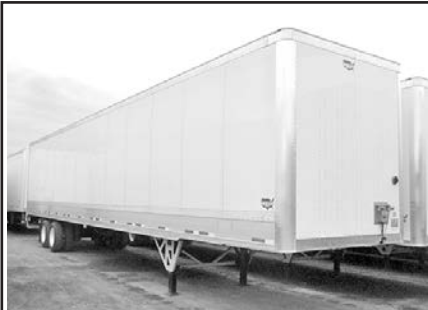
(10) Wabash HD van trlrs., 53'x102", 24K floor rating, rub rail, air inflation, full noseliner, CALL FOR DETAILS!

www.TNTtrailerSales.com Complete Inventory Online!