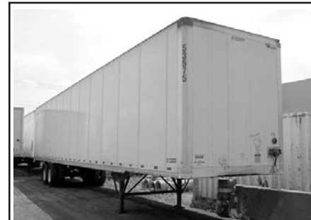
'12 Stoughton, 53'x102", alum. roof, air ride.