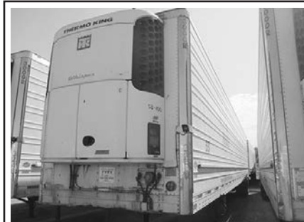
(4) '06 & '07 Utility reefer trlrs., TK units, 53'x102" CALL FOR PRICING.