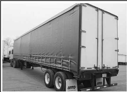
'06 Utility curtainside, 48'x102", air ride, 22.5 LP tires, priced to sell, $15,000