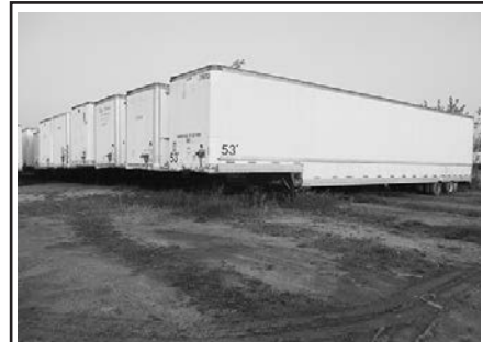
(5) '05 Wabash drop vans, 53'x102", ceiling protection, rub rail, PRICED TO SELL!