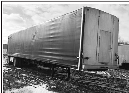
(2) Transcraft Conestoga, 48'x102", fixed spread, air ride, Roll Tight System.