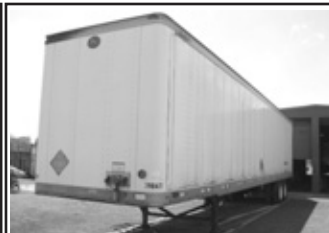
'00 G/Dane 48'x102", air ride, R.U. door, liftgate, avail. for sale or lease.