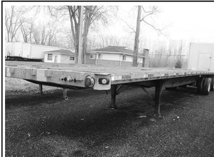
(3) '98 G/Dane flatbeds, 48'x102", air, $4,250.