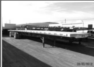
New '12 Transcraft 53'x102" Eagle alum. combo flats, all alum. but main beam, sldg. rear axle for CA legal, call for pricing.