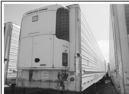
'07 Utility reefer trlr., TK unit, 53'x102", CALL FOR PRICING.