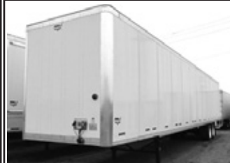
{10} (4) Left! '13 Wabash Duraplates, 53'x102", alum. roof, Turner air ride, LP 22.5 disc whls.