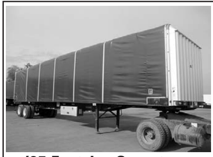
'05 Fontaine Conestoga, 48'x102", Aero Conestoga system, toolbox, Hutchens susp.