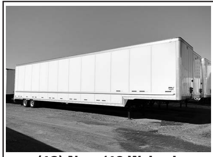
(12) New '19 Wabash drop vans, 16.5" drop, 245/70R17.5 Michelin tires, air inflation, lower rub rail, galv. rear.