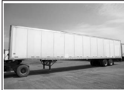
(24) '11 Wabash Duraplate, 53'x102", alum. roof.