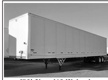
(50) New '19 Wabash Duraplate, rub rail, air inflation, galvanized rear, COMING IN DECEMBER.

FULL TIME EXPERIENCED PARTS SALESPERSON WANTED FOR DETROIT AREA.