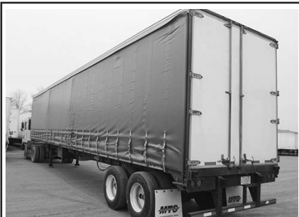
'06 Utility curtainside, 48'x102", air ride, 22.5 LP tires, priced to sell, $15,000