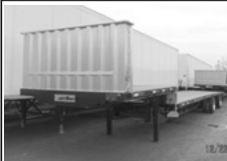
(2) New '13 Transcraft DTL-2100, 53'x102", air ride drop w/ sld. rear axle for CA legal, trlrs., on order & avail. soon! Call for pricing.