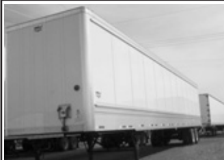
(40) '13 Wabash Duraplate HD models w/dbl. rub rails, galv. rear & bumpers, Magnum gear, Turner air ride, LP 22.5 disc whls., CFP.