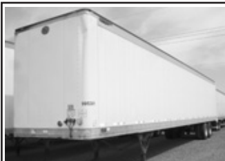
• (3) 53' Cartage vans, R.U. doors, (1) air ride, (2) spg. ride, CLEAN! • '99 G/Dane 53'x102", air ride, R.U. door, newly painted rear frame.