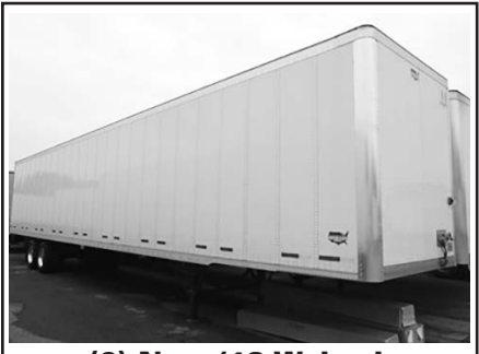
(6) New '18 Wabash Duraplate, 24" logistic, air inflation, full Duraplate nose liner. JUST ARRIVED!