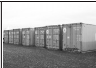
Misc. 40' & 20' containers avail. for sale or lease, call for pricing.

See Our Inventory Online at www.TNTtrailersales.com