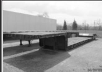
'96 Talbert dbl. drop, 48'x102", 29'10" in well, 9'4" frt. deck & 8'6" rear deck, 16" load ht., air ride, call for pricing.