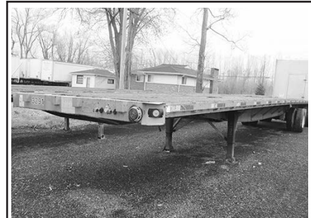
(2) '98 G/Dane flatbeds, 48'x102", air, $4,000.