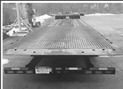
'07 Landoll 930, 20K winch, clean, CALL FOR PRICING.