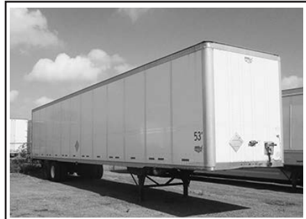
(10) '08 Wabash Duraplate, 53'x102", alum. roof, swg. door, air ride, CALL FOR PRICING.