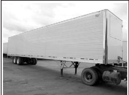
(5) New '18 Wabash Arctic Lite reefer trlrs., prepped, side 2.0, floor 2.5, roof 2.5, air inflation, grease hubs.