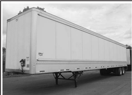
'12 Wabash HD, air ride, alum. roof, dbl. rub rail, 53'x102", swg. doors, $18,500.

www.TNTtrailerSales.com Complete Inventory Online!