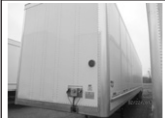
{2} (1) Left! New '12 Wabash Duraplate, 53'x102" loaded! Stainless rears, full Bulitex ceiling liner, Turner air ride, LP 22.5 disc.