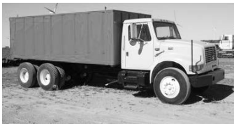
#3271 - '00 Int'l. 4900, 86,592 miles, DT466, 225 hp, new brakes & drums, 14.6F, 40R, Hend. beam, Allison auto. 653, 5.38 ratio, 156" C.T., 18" used box, frt. post hoist, from Tennessee, no rust, $41,000.