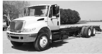
#3268 - '09 Int'l. 4400, DT466, 260 hp, 12F, 40R, air ride, Allison auto. XMSN 3000HS, 5.29 ratio, 272" WB, A/C & cruise, $32,000.