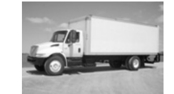
#2908 - '05 Int'l. 4300, DT466, 215/225 hp, 6 spd., 12F, 21R, 33,000 GVW, 22'x96" van, R.U. door, Penske maintained, very clean truck, $18,900.