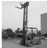
Toyota 2FG40, 16' lift, 7000# cap., runs good, works good.