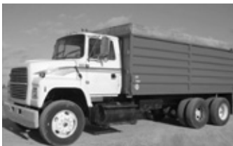
'95 Ford LNT9000, 386,568 miles, L10 Cum., 270 hp, 10 spd., 50% brakes, 295R22.5 80% steers, drive 50%, 12F, 34R, Hend., 46,000 GVW, 3.91 ratio, 258" WB, 193" C.A./C.T., $31,643.