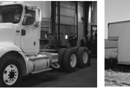
#3207A - (10) Used van bodies, call.