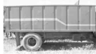
#2853, Used 16' thumb truck box w/50" sides & Galion twin hoist, good cond., reduced, $3,500.