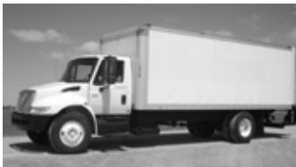
'06 Int'l. 4400, 205,000 miles, DT466, 250 hp, 10 spd., 12F, 40R, air ride, 28'x102" van, 91" high, R.U. door, nice truck, $38,900.