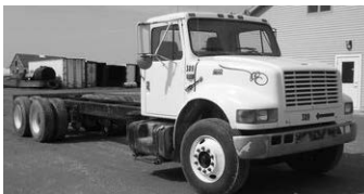
#3282 - '00 Int'l. 4900, DT466, 240 hp, runs good, 14F, 40R, air ride, dump valve, Allison auto. 5 spd. 3060P/PTO creeper, 5.38 ratio, 25' of frame, project truck, call for details, $6,500 or best offer.