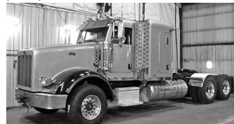
#3260 - '10 Pete 367, ISX, 525 hp, 18 spd., 324,000 miles, 20F, 46R, 4:10 ratio, 244" WB, 48" slpr, wet lines, all new paint, right tank 150-gal., left tank split fuel 80-gal., oil 70-gal., lockers, new tires, like new brakes, call.