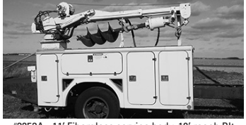
#3253A - '11' Fiberglass service body, 10' reach Pitman, HY crane & winch, 12-volt-110 elec. converters, HY legs on back for crane, winch cap. 25000 lbs. to 7000 lbs., $5,500.