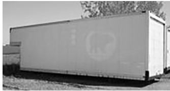
#3207A - (10) Used van bodies, call.