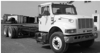
#3282 - '00 Int'l. 4900, DT466, 240 hp, runs good, 14F, 40R, air ride, dump valve, Allison auto. 5 spd. 3060P/PTO creeper, 5.38 ratio, 25' of frame, project truck, call for details, $6,500 or best offer.