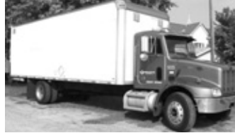
'04 Pete 330, C7 Cat, 212 hp, Allison 2000 auto., air brakes, 26,000 GVW, 26'x102" 87" high van body w/R.U. door, $18,900 reduced $15,500.