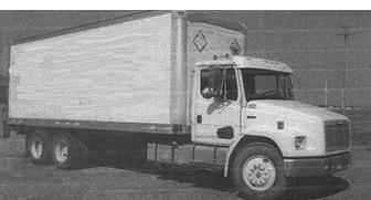
'03 FTL FL80, 3126 Cat, 300 hp, 50% 11x22.5 tires, 14F, 40R, air ride, 9 spd., A/C, cruise, 26"x102" van body, liftgate, call.