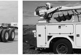
#3253A - 11' Fiberglass service body, 10' reach Pitman, HY crane & winch, 12-volt-110 elec. converters, HY legs on back for crane, winch cap. 25000 lbs. to 7000 lbs., $5,500.