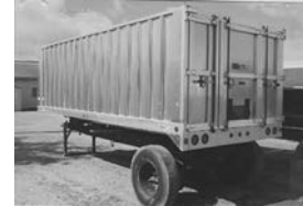
New all alum. Dakota 19"x96", 62" sides, ladder bolt on side of box over tires, 3/16 alum. extruded inner locking floor, C/M 4" channel on 15" centers, long beams 8" alum. channel, top rail 4x4x3/16 tubing, 3-pc. swg. tailgate, w/H.D. hinges, (3) latches, grain hole, $13,090 plus taxes & freight, your choice of hoist.