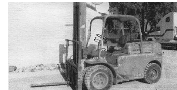
#Hyster Fork Lift - '69 Hyster H80C, 6-cyl. Continental F227, 3 spd. w/forward & rev., 12,150#, 46" forks, 6% back tilt, 8500# max. load at 18", 14' lift ht.

Visit our website for several more units! Over 80 units in stock! www.ThumbTruck.com