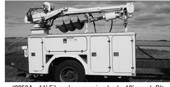
#3253A - 11' Fiberglass service body, 10' reach Pitman, HY crane & winch, 12-volt-110 elec. converters, HY legs on back for crane, winch cap. 25000 lbs. to 7000 lbs., $5,500.