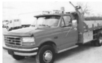
'92 Ford F450, 165,000 miles, 7.3 dsl., 5 spd. stick, Michelin LT 235/85R16 tires, 70%, 12' flatbed w/ wood floor, elec. winch on pole, elec. brakes in rear, hitch, clean, $4,500.