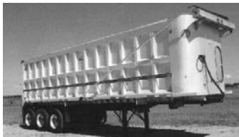
#3110 - '02 Benson 34'x96", 84" sides, tri-axle, alum. 10-hole pilot rims, 74B tri-axle, call.