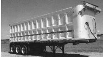
#3110 - '02 Benson 34"x96", 84" sides, tri-axle, alum. 10-hole pilot rims, 74B tri-axle, call.