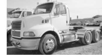
#3026 - '97 Ford 9513, 463,515 miles, N14 Cum., 370/435 hp, 10 spd., 12F, 40R, air ride, 3.90 ratio, $15,000.