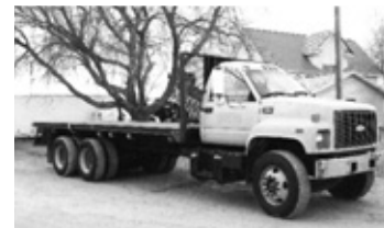
#3093 - '02 Chevy C8500, 196,889 miles, 3126 Cat, 300 hp, 8LL trans., 14F, 40R Hend., 3.90 ratio, 21'x96" steel flatbed, (6) ratchet straps, forklift mount on back, $24,000.

Visit our website for several more units! Over 80 units in stock! www.ThumbTruck.com