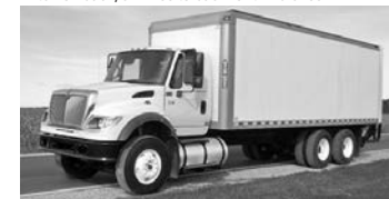
#3195 - '06 Int'l. 7600, 416,000 miles, ISM 305 hp, 10 spd. FRO11210C O.D., all new brakes, 24"x102"x91" van, 11x22.5 tires, 12F, 40R, 4.30 ratio, 260" WB, 191" C.T., call.