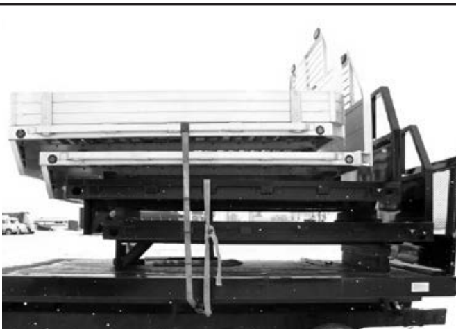
New & used flatbeds.