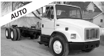
#3200 - '03 FTL FL80, 231,000 miles, Cat 3126, 250 hp, Allison auto., 14F, 40R, air ride, 5.29 ratio, 25' of dbl. frame, call.