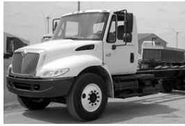
#3241 - '04 Int'l. 4400, DT466, 250 hp, 11x22.5 tires, (8) new recaps, 14F, 40R air ride, 5 spd. Allison w/PTO gear, 5.29 ratio, 256" WB, 188"CT, A/C, cruise, tilt, AM/FM/CD, susp. dump valve, 3/8 single frame, 26" of frame, call.