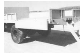
14' Flatbed - (2) New 14' steel contractors bodies, ladder on back, 26"x36" tool box, $3,500.