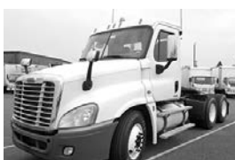
#3261 - '09 FTL Cascadia, 523,000 miles, 14L Det., 455 hp, 10 spd., 12F, 40R, air ride, 3.70 ratio, 180" WB, A/C, Jake, cruise, Penske maintained, $35,000.