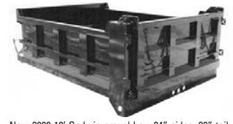
New 3000 10' Godwin gravel box, 24" sides, 30" tailgate & bulkhead, hoist kit dbl. arm under body, F.O.B. Pigeon, $6,950 plus tax & installation.