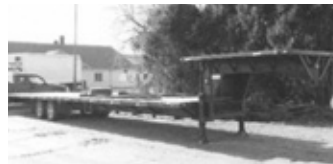
#3046 - '97 Oklahoma 48'x102", 20,000 GVW, elec. brakes, (2) 10,000# axles, 12' ramps, 8' top deck, 40" btm. deck, good deck, good paint, w/2-5/16" ball hitch adapter, $8,500.