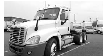
#3261 - '09 FTL Cascadia, 523,000 miles, 14L Det., 455 hp, 10 spd., 12F, 40R, air ride, 3.70 ratio, 180" WB, A/C, Jake, cruise, Penske maintained, $35,000.