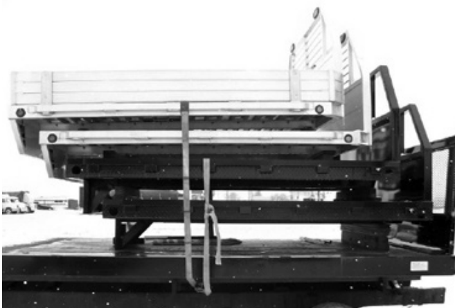
New & used flatbeds.