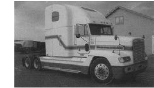
#2024 - '01 FTL FLD120, 12.7 Det., 430 hp, Super 10M w/Top 2 Autoshift, 95% air brakes, 12F, 40R, 236" WB, (4) super singles, $13,000.