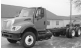
#3043 - '05 Int'l. 7600, ISM Cum., 310 hp, 10 spd., 12F, 40R, air ride, 3.90 ratio, 21' frame, Penske maintained, $35,500.