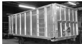
Used 20'6"x102" all alum. box, 72" sides, new frt. post hoist, new air latch tailgate, call.