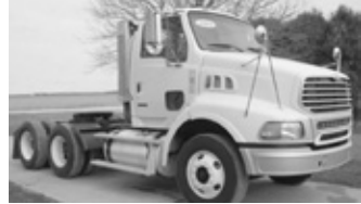
#3039 - (2) '04 Sterling AT913, 535,619 miles, C13 Cat, 380/410 hp, 10 spd., like new air brakes, 22.5 new caps, 12F, 40R, air ride, 3.91 ratio, 160" WB, $25,750.

OFF SEASON DISCOUNT - 5% On Boxes & Work Done In Shop & Paid Upon Completion!