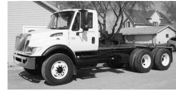
#3284 - '06 IH 7400, 57,275 (ECM) miles, DT466, 260 hp, air brakes like new, 11x22.5 drives 75% caps, 12F, 34R Hend. beam, 315/80R22.5 tires 80%, Auro 5 spd. 3060P/PTO gear, 6.17 ratio, 189" WB, 15' frame, CT 122, pintle hitch on back, air lines to back for trlr. brakes.