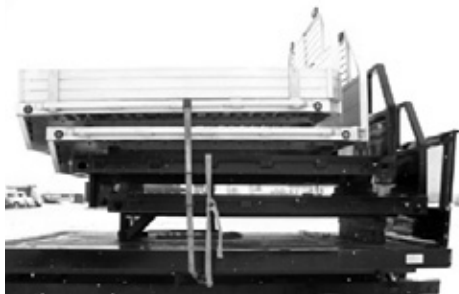
New & used flatbeds.

WE SHIP ANYWHERE SAME DAY SHIPPING IF ORDERED BY 12 P.M.