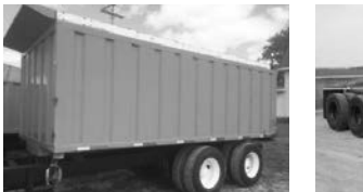
#3263A - Used 18-1/2' steel farm box, 64" sides, 2'x6" side boards, frt. post hoist, air tailgate, call.