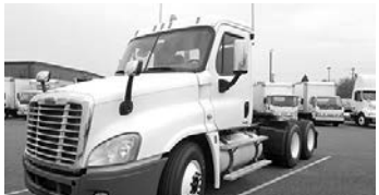
#3261 - '09 FTL Cascadia, 523,000 miles, 14L Det., 455 hp, 10 spd., 12F, 40R, air ride, 3.70 ratio, 180" WB, A/C, Jake, cruise, Penske maintained, $35,000.