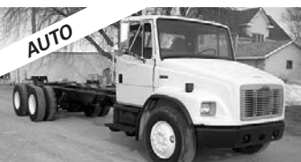
#3200 - '03 FTL FL80, 231,000 miles, Cat 3126, 250 hp, Allison auto., 14F, 40R, air ride, 5.29 ratio, 25' of dbl. frame, call.