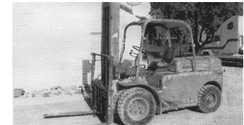
#Hyster Fork Lift - '69 Hyster H80C, 6-cyl. Continental F227, 3 spd. w/forward & rev., 12,150# 46" forks, 6% back tilt, 8500# max. load at 18", 14' lift ht.

Visit our website for several more units! Over 80 units in stock! www.ThumbTruck.com