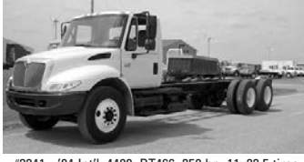
#3241 - '04 Int'l. 4400, DT466, 250 hp, 11x22.5 tires, (8) new recaps, 14F, 40R air ride, 5 spd. Allison w/PTO gear, 5.29 ratio, 256" WB, 188" CT, A/C, cruise, tilt, AM/FM/CD, susp. dump valve, 3/8 single frame, 26' of frame, call.