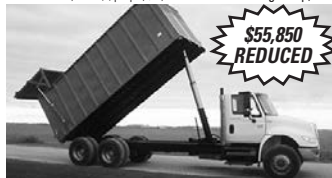
#3107 - '05 Int'l. 4400, DT466, 285 hp, 10 spd., 14F, 40R, air ride, new steel 20'x102", 72" sides, silage, grain, sugar beets, 190" frt. post hoist, 36" air hi-lift tailgate, $60,000 reduced to $55,850 + F.E.T. & sales tax.