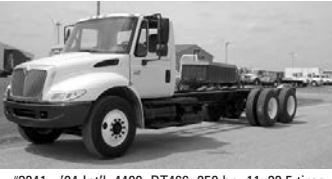
#3241 - '04 Int'l. 4400, DT466, 250 hp, 11x22.5 tires, (8) new recaps, 14F, 40R air ride, 5 spd. Allison w/PTO gear, 5.29 ratio, 256" WB, 188" CT, A/C, cruise, tilt, AM/FM/CD, susp. dump valve, 3/8" single frame, 26" of frame, call.