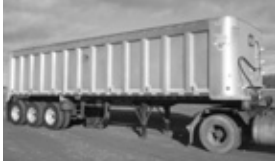
#3065 - '07 MAC 35'x102", 76" sides, 11R24.5, alum. O/S, LED lights, $39,500.