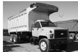
#3250 - '02 Chevy 8500, 3126 Cat, 300 hp, 8LL trans., 12F, 40R, Hend. beam, 3.90 ratio, 19'x96" MAC Alum box, 72" sides, plus 2x6 side boards, 78" high grain hole, air tailgate, slide & go tarp, GA truck, no rust, call.