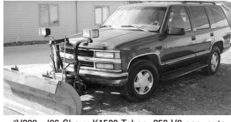
#V309 - '96 Chevy K1500 Tahoe, 350 V8 gas, auto., like new Firestone tires, 188,400 miles, good Curtis snowplow, $3,800.