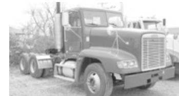
#V3010 - '99 FTL FLD12064ST, 523,800 miles, ML Cum. Plus, 370 hp, 10 spd., 12F, 46R, air ride, used wet lines, $18,000.