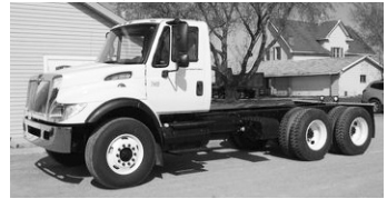
#3284 - '06 IH 7400, 57,275 (ECM) miles, DT466, 260 hp, air brakes like new, 11x22.5 drives 75% caps, 12F, 34R Hend. beam, 315/80R22.5 tires 80%, Auro 5 spd. 3060P/PTO gear, 6.17 ratio, 189" WB, 15" frame, CT 122, pintle hitch on back, air lines to back for trlr. brakes.