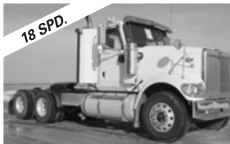
#3061 - '06 Int'l. 9900i, ISX Cum., 500 hp, 18 spd., 14.6F, 46R, 4.10 ratio, 201" WB, Ryder maintained, Jake, Eagle int., $46,000.