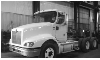
#3164 - '07 Int'l. 9200i, 415,027 miles, Cum. ISX 453 hp, 10 spd. Fuller trans., 11x22.5 tires, 12F, 40R air ride, 3.73 ratio, new paint on frame & cab, call.