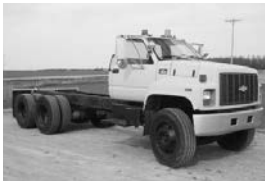
#3285 - '99 Chevy C8500, only 79,214 miles, Cat 3126 230 hp, brakes like new, 11x22.5 drives 80%, steering 80%, L40%, R75%, 14.6F, 34R Hend. beam, Allison auto 653 PTO gear, 4.33 ratio, CT 124, 15' frame, pintle hitch, air lines to back for trlr. brakes, driver's seat air ride, seats (3) people, $14,500.