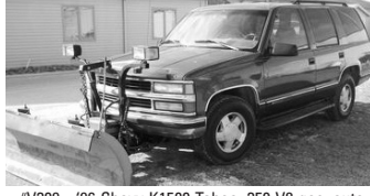
#V309 - '96 Chevy K1500 Tahoe, 350 V8 gas, auto., like new Firestone tires, 188,400 miles, good Curtis snowplow, $3,800.