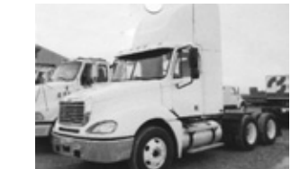
#3041 - (1) '04 & (3) '05 FTL Columbia CL120, 12.7 & 14L Det., 445 hp @ 1888 rpm, 10 spd. FR014210C, 12F, 40R, air ride, 3.73 ratio, Ryder maintained, cruise, nice, clean truck, $33,000.