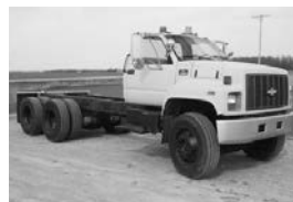
#3285 - '99 Chevy C8500, only 79,214 miles, Cat 3126 230 hp, brakes like new, 11x22.5 drives 80%, steering 80%, L40%, R75%, 14.6F, 34R Hend. beam, Allison auto 653 PTO gear, 4.33 ratio, CT 124, 15" frame, pinde hitch, air lines to back for trlr. brakes, driver's seat air ride, seats (3) people, $14,500.