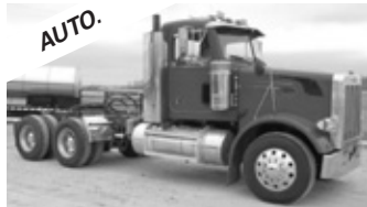
#3068 - '93 Pete 378, 225,797 miles, 3306 Cat, auto. HT-7500R, 80% air brakes, new steer 295R22.5 tires, virgin drive 295R22.5 85% tires, 12F, 40R, Hend. beam, 52,000 GVW, 5.46 ratio, 204" WB, 112" C.A./C.T., $28,300.