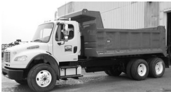
#3278 - '08 FTL M2, 341,000 miles, Cum. ISC, 330 hp, 16F, 315R22.5 frt. @ 75%, 40R, air ride, FROF12210C 10 spd., 4.33 ratio, new American 15' gravel box, all hi-tensile steel, 3/16 floor, 1-pc. 50,000 PSI, 44" sides, Ryder maintained, call.