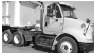
#2934 - '05 Int'l. 8600, 454,604 miles, ISM Cum., 410/435 hp, 10 spd., 12F, 40R, air ride, 3.90 ratio, air ride cab, Jake, cruise, A/C, tilt, Penske lease truck, $32,500.