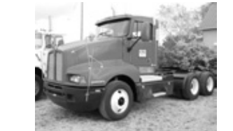
#3011, '03 KW T600, C12 Cat, 435 hp, 10 spd., 12F, 40R, air ride 8-bag susp., 3.90 ratio, 172" WB, $25,550.