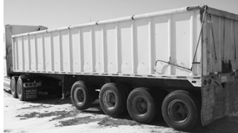
#3239 - '83 TTE dump, steel, (2) lift axles, 11x22.5, 75%, 75% brakes, ShurLok roll tarp, alum. tailgate, air tailgate latch, good trlr. for age, $17,500 reduced to $16,500.