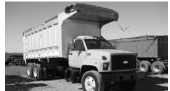
#3250 - '02 Chevy 8500, 3126 Cat, 300 hp, 8LL trans., 12F, 40R, Hend. beam, 3.90 ratio, 19"x96" MAC Alum box, 72" sides, plus 2x6 side boards, 78" high grain hole, air tailgate, slide & go tarp, GA truck, no rust, call.