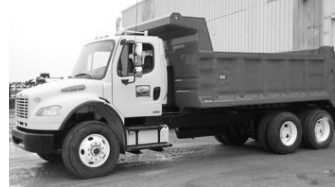
#3278 - '08 FTL M2, 341,000 miles, Cum. ISC, 330 hp, 16F, 315R22.5 frt. @ 75%, 40R, air ride, FROF12210C 10 spd., 4.33 ratio, new American 15' gravel box, all hi-tensile steel, 3/16 floor, 1-pc. 50,000 PSI, 44" sides, Ryder maintained, call.