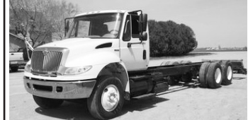
#3268 - '09 Int'l. 4400, DT466, 260 hp, 12F, 40R, air ride, Allison auto. XMSN 3000HS, 5.29 ratio, 272" WB, A/C & cruise, $30,000.