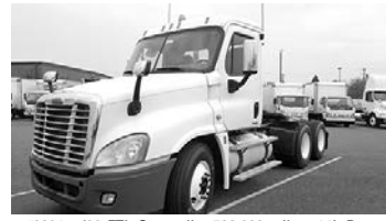
#3261 - '09 FTL Cascadia, 523,000 miles, 14L Det., 455 hp, 10 spd., 12F, 40R, air ride, 3.70 ratio, 180" WB, A/C, Jake, cruise, Penske maintained, $35,000.