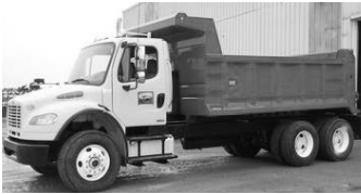
#3278 - '08 FTL M2, 341,000 miles, Cum. ISC, 330 hp, 16F, 315R22.5 ft. @ 75%, 40R, air ride, FROF12210C 10 spd., 4.33 ratio, new American 15" gravel box, all hi-tensile steel, 3/16 floor, 1-pc. 50,000 PSI, 44" sides, Ryder maintained, call.