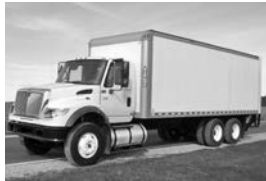
#3195 - '06 Int'l. 7600, 416,000 miles, ISM 305 hp, 10 spd. FRO11210C O.D., all new brakes, 24"x102"x91" van, 11x22.5 tires, 12F, 40R, 4.30 ratio, 260" WB, 191" C.T., call.