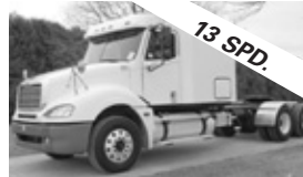
#3072 - '06 FTL FCL12064T, 565,814 miles, C13 Cat, 430 hp, 13 spd., air brakes, 11R22.5 80% tires, 12F, 40R, air ride, 52,000 GVW, 247" WB, 112" C.A./C.T., $29,500.