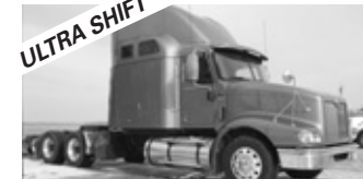
#3074 - '07 Int'l. 9400i, 666,470 miles, ISX Cum., 450 hp, 10 spd. auto. shift, 75-80% air brakes, 445/50R22.5 45%, 12F, 40R, air ride, 52,000 GVW, 3.55 ratio, 238" C.A./C.T., 3.55 ratio, $27,500.