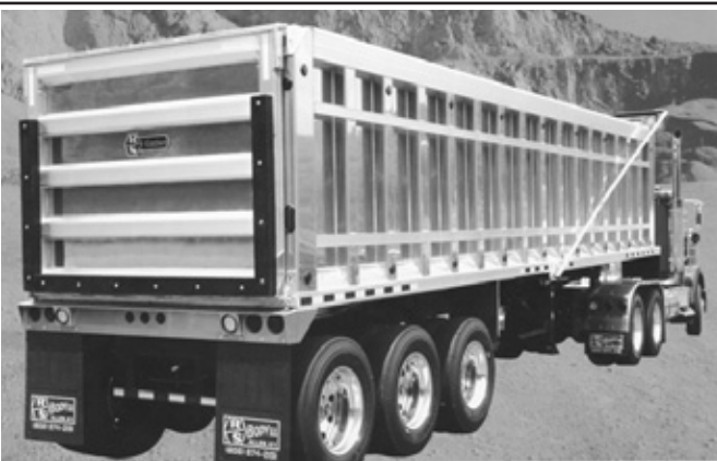
Dealer for Godwin.