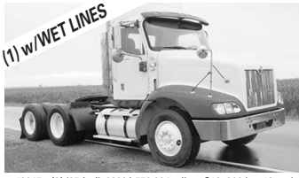
#3245 - (3) '05 Int'l. 9200i, 570,204 miles, C13, 380 hp, 10 spd., 80% brakes, 295R22 tires, 12F, 40R, air ride tdm, 52,000 GVW, 3.73 ratio, 164" WB, 95" C.T., A/C, cruise, Jake, very clean truck, AM-FM-CD, $30,000. (1) Matching w/wetlines.