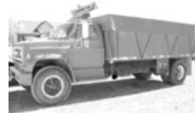
#2890, '78 Chevy C65, 65,454 miles, 427 gas, 5/2 spd., air brakes, 15" steel TTE farm box, great shape, 50" sides, tarp, grain hole, exc. cond., very little rust, $9,800.