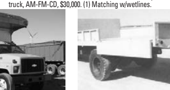
#3250 - '02 Chevy 8500, 3126 Cat, 300 hp, 8LL trans., 12F, 40R, Hend. beam, 3.90 ratio, 19"x96" MAC Alum box, 72" sides, plus 2x6 side boards, 78" high grain hole, air tailgate, slide & go tarp, GA truck, no rust, call.