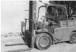
#Hyster Fork Lift - '69 Hyster H80C, 6-cyl. Continental F227, 3 spd. w/forward & rev., 12,150#, 46" forks, 6% back tilt, 8500# max. load at 18", 14" lift ht.