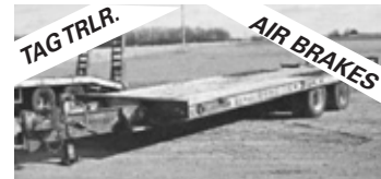
#3037 - '98 Dynaweld, 20' deck, 5' beavertail, 215/85R16, 60/70%, spg. susp., 10-ton tag trlr., 5-1/2" ramps, nice trlr., $6,500.