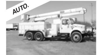
#2944 '95 Int'l. 4900, 181,000 miles, DT466 230 hp, 653 Allison auto., 34R on Hend. beam, 4.78 ratio, 150" C.A./C.T., 49" bkt. Ranger truck, exc. cond., check website for details, $18,000.