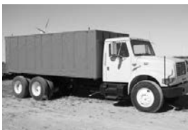
#3271 - '00 Int'l. 4900, 86,592 miles, DT466, 225 hp, new brakes & drums, 14.6F, 40R, Hend. beam, Allison auto. 653, 5.36 ratio, 156" C.T., 18" used box, frt. post hoist, from Tennessee, no rust, $41,000.