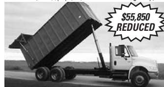
#3107 - '05 Int'l. 4400, DT466, 285 hp, 10 spd., 14F, 40R, air ride, new steel 20"x102", 72" sides, silage, grain, sugar beets, 190" frt. post hoist, 36" air hi-lift tailgate, $60,000 reduced to $55,850 + F.E.T. & sales tax.