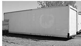
#3207A - (10) Used van bodies, call.