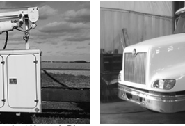
#3164 - '07 Int'l. 9200i, 415,027 miles, Cum. ISX 453 hp, 10 spd. Fuller trans., 11x22.5 tires, 12F, 40R air ride, 3.73 ratio, new paint on frame & cab, call.