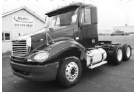
#3273 - '07 Columbia, 531,000 miles, 14L Det., 455 hp, 12F, 40R, air ride, 10 spd., 3.73 ratio, 169" WB, Ryder maintained, $32,000.