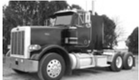
#3071 - '00 Pete 378, 371,185 miles, C15 Cat, 435 hp, 10 spd., 80% air brakes, 295R22.5 tires, 80%, alum. frt. only, 12F, 40R, Pete air ride, 52,000 GVW, 3.90 ratio, 191" WB, 99" C.A./C.T., $27,000.