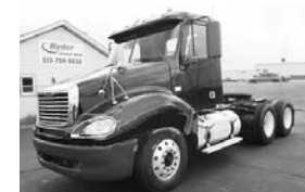
#3273 - '07 Columbia, 531,000 miles, 14L Det., 455 hp, 12F, 40R, air ride, 10 spd., 3.73 ratio, 169" WB, Ryder maintained, $32,000.