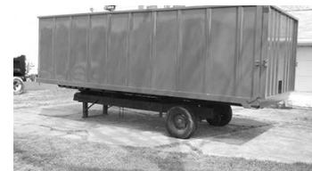
#3045A - (2) New 18' TTT steel farm box, 10-ga. floor, 62" sides, air tailgate, frt. post hoist, call.