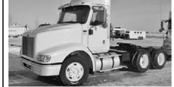
#3242 - '05 Int'l. 9200i, C13, 380 hp up to 470 hp, 10 spd., 12F, 40R, air ride tdm., air ride cab, $25,500.