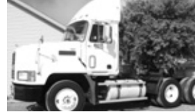
'03 Mack CH613, E7 Mack, 427 hp, 10 spd., 40R, air ride, .390 ratio, $28,000 reduced $24,000.

OFF SEASON DISCOUNT - 5% On Boxes & Work Done In Shop & Paid Upon Completion!