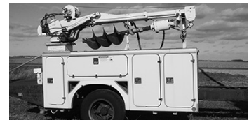
#3253A - 11' Fiberglass service body, 10' reach Pft-man, HY crane & winch, 12-volt-110 elec. converters, HY legs on back for crane, winch cap. 25000 lbs. to 7000 lbs., $5,500.