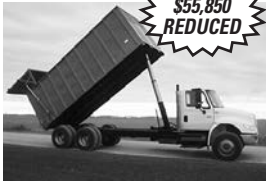
#3107 - '05 Int'l. 4400, DT466, 285 hp, 10 spd., 14F, 40R, air ride, new steel 20"x102", 72" sides, silage, grain, sugar beats, 190" frt. post hoist, 36" air hi-lift tailgate, $69,000 reduced to $55,850 + F.E.T. & sales tax.