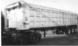
#3038 - '92 Trailstar 36'x102", 72" sides, 11R24.5 50/60% tires, $25,500.

COMING IN SOON: '04 Benson 35'x102", 76" sides, $35,000.