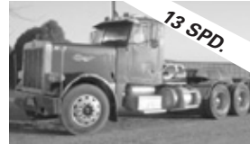
'02 Pete 379, C15 Cat, 475 hp, (12) alum. rims, 12F, 46R, 13 spd., 3.90 ratio, Jake, $39,000.