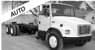
#3200 - '03 FTL FL80, 231,000 miles, Cat 3126, 250 hp, Allison auto., 14F, 40R, air ride, 5.29 ratio, 25' of dbl. frame, call.