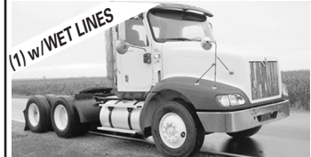
#3245 - (3) '05 Int'l. 9200i, 570,204 miles, C13, 380 hp, 10 spd., 80% brakes, 295R22 tires, 12F, 40R, air ride tdm., 52,000 GVW, 3.73 ratio, 164" WB, 95" C.T., A/C, cruise, Jake, very clean truck, AM-FM-CD, $30,000. (1) Matching w/wetlines.