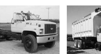
#3285 - '98 Chevy C8500, only 79,214 miles, Cat 3126 230 hp, brakes like new, 11x22.5 drives 80%, steering 80%, L40%, R75%, 14.6F, 34R Hend. beam, Allison auto 653 PTO gear, 4.33 ratio, CT 124, 15" frame, pintle hitch, air lines to back for trlr. brakes, driver's seat air ride, seats (3) people, $14,500.