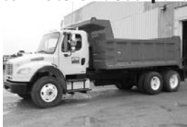
#3278 - '08 FTL M2, 341,000 miles, Cum. ISC, 330 hp, 16F, 315R22.5 ft. @ 75%, 40R, air ride, FROF12210C 10 spd., 4.33 ratio, new American 15' gravel box, all hi-tensile steel, 3/16 floor, 1-pc. 50,000 PSI, 44" sides, Ryder maintained, call.