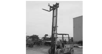
Toyota 2FG40, 16' lift, 7000# cap., runs good, works good.