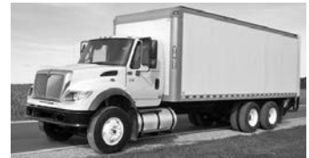
#3195 - '06 Int'l. 7600, 416,000 miles, ISM 305 hp, 10 spd. FRO11210C O.D., all new brakes, 24"x102"x91" van, 11x22.5 tires, 12F, 40R, 4.30 ratio, 260" WB, 191" C.T., call.