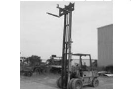
Toyota 2FG40, 16' lift, 7000# cap., runs good, works good.