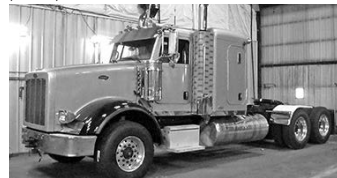
#3260 - '10 Pete 367, ISX, 525 hp, 18 spd., 324,000 miles, 20F, 46R, 4:10 ratio, 244" WB, 48" slpr., wet lines, all new paint, right tank 150-gal., left tank split fuel 80-gal., oil 70-gal., lockers, new tires, like new brakes, call.