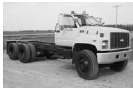
#3285 - '98 Chevy C8500, only 79,214 miles, Cat 3126 230 hp, brakes like new, 11x22.5 drives 80%, steering 80%, L40%, R75%, 14.6F, 34R Hend. beam, Allison auto 653 PTO gear, 4.33 ratio, CT 124, 15' frame, pintle hitch, air lines to back for trlr. brakes, driver's seat air ride, seats (3) people, $14,500.