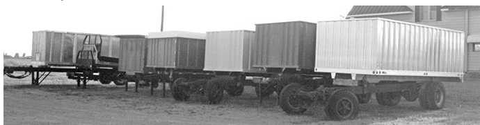
New & used farm bodies, (2) new 18' steel, (1) new 19' alum., used 18' steel, 8' alum. flat, 9' steel flat, 8' steel flat.