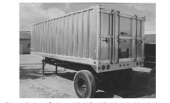
New all alum. Dakota 19'x96", 62" sides, ladder bolt on side of box over tires, 3/16 alum. extruded inner locking floor, C/M 4" channel on 15" centers, long beams 8" alum. channel, top rail 4x4x3/16 tubing, 3-pc. swg. tailgate, w/H.D. hinges, (3) latches, grain hole, $13,090 plus taxes & freight, your choice of hoist.