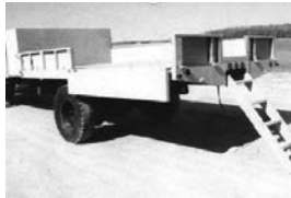
14' Flatbed - (2) New 14' steel contractors bodies, ladder on back, 26"x36" tool box, $3,500.

More trucks on our website! Lots of used parts! www.ThumbTruck.com