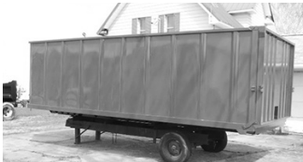
#3045A - (2) New 18' TTT steel farm box, 10-ga. floor, 62" sides, air tailgate, frt. post hoist, call.