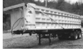
'92 Benson 34'x96", center pt. tdm., 24.5 tires.

COMING IN SOON: '04 Benson 35'x102", 76" sides, $35,000.