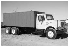
#3271 - '00 Int'l. 4900, 86,592 miles, DT466, 225 hp, new brakes & drums, 14.6F, 40R, Hend. beam, Allison auto. 653, 5.38 ratio, 156" C.T., 18' used box, frt. post hoist, from Tennessee, no rust, call.