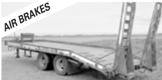
(5) Tag trlrs. to choose from, all air brakes.