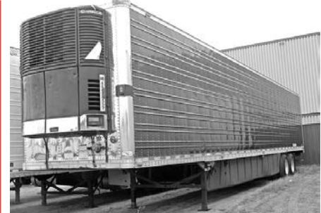
2006 Great Dane reefers , 53'x102", Carrier units, flat floor, logistic posts, air ride, sliding tandem.

53'x102", complete stainless, heavy duty aluminum flat floor, disc brakes, many extras.