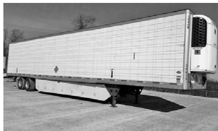
(30) 2012 Utility 53'x102" duct floor reefers , air ride slide, swing doors, stainless steel rear frames, Thermo King units, super single tires.