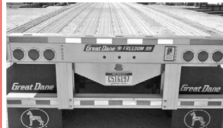
New 2018 Great Dane flats , 48' & 53' aluminum, combo, steel and drop decks.

10% Down, 48 month term, 10% buyout at end of term, subject to credit review and approval.