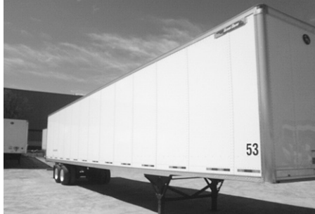
Coming in: (50+) 2019 Great Dane 53'x102" dry vans , air ride, tire inflation system, skirts, sliding tandem, 50" & 24" logistic posts.