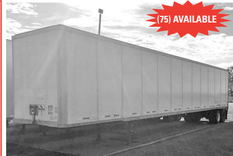
2004-2007 Wabash 53'x102" dry vans , translucent & aluminum roof, spring & air ride, limited number of stainless steel doors, sheet & post & composite options.

10% Down, 48 month term, 10% buyout at end of term, subject to credit review and approval.