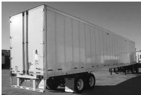
(15+) 2013 Wabash Duraplates , 53'x102", air ride, swing doors, aluminum roof, 24" logistic post.