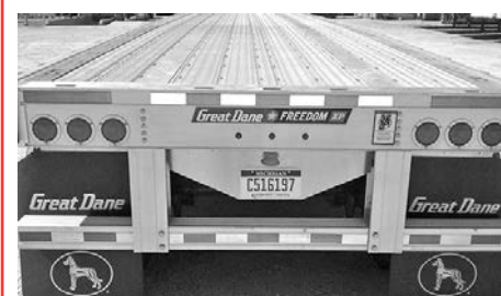
New 2018 Great Dane flats , 48' & 53' aluminum, combo, steel and drop decks.