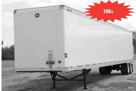
NEW 2018 Great Dane CS1 , 53'x102", logistic posts on 16" centers, air ride sliding tandem, swing doors, EnduroGuard rear door frame, air assist pin release, tire inflation system.