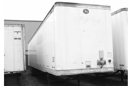
2006 Great Dane 53'x102" dry vans , swing doors, aluminum roof, spring ride.