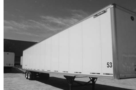
2018 Great Dane Composite Plate Van , 53'x102", air ride sliding tandem, swing doors, EnduroGuard rear door frame, Prolam Waxin floor coating, air assist pin release, 24" and 48" logistics posts.