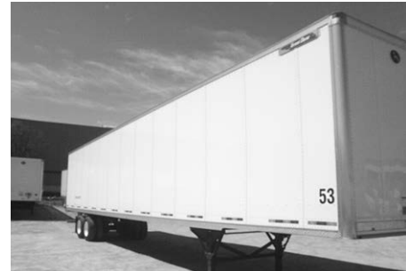
2018 Great Dane Composite Plate Van , 53'x102", air ride sliding tandem, swing doors, EnduroGuard rear door frame, Prolam Waxin floor coating, air assist pin release, 48" logistics posts.