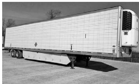
(20) (10) 2012 Utility 53'x102" duct floor reefers , air ride slide, swing doors, stainless steel rear frames, Thermo King units, super single tires.