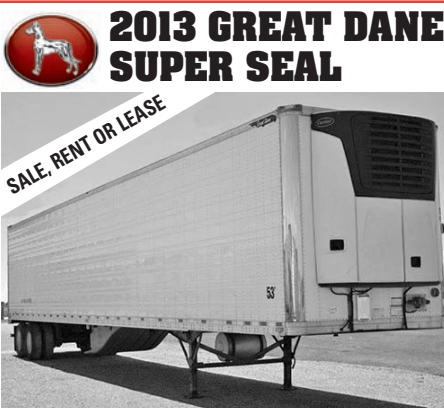
(40+) 2013 Great Dane 53'x102" duct floor reefers , air ride slide, stainless steel frame, swing doors, Carrier units, tire inflation system,