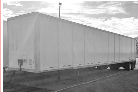
2004-2007 Wabash 53'x102" dry vans , translucent & aluminum roof, spring & air ride, limited number of stainless steel doors, sheet & post & composite options.