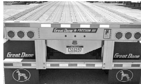
New 2018 Great Dane flats , 48' & 53' aluminum, combo, steel and drop decks.