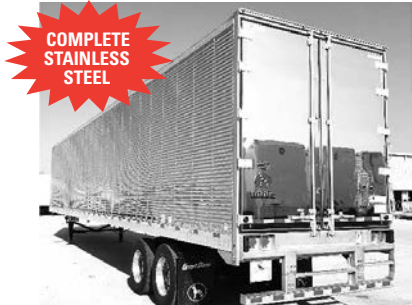
New 2018 Great Dane stainless steel reefers , 53'x102", complete stainless, heavy duty aluminum flat floor, disc brakes, many extras.