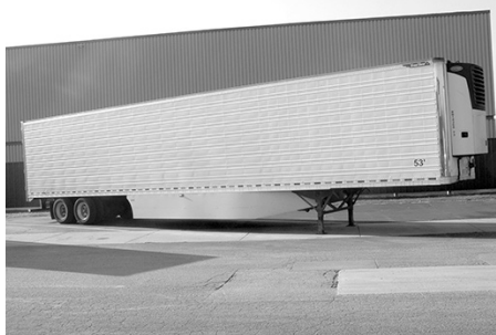
2014 Great Dane reefers , 53'x102", duct floors, Carrier units, air ride, skirts, trailer tail, air chute, aluminum wheels, tire inflation system, large quantity available.