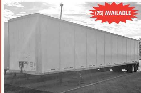
2004-2007 Wabash 53'x102" dry vans , translucent & aluminum roof, spring & air ride, limited number of stainless steel doors, sheet & post & composite options.