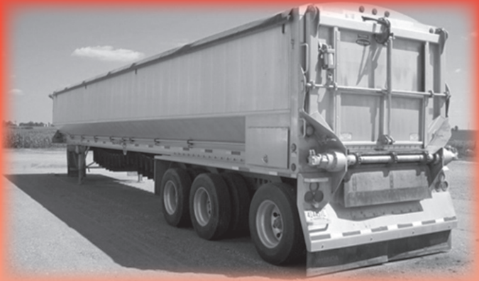
'13 Walinga 50' belt unload trailer, $97,000.