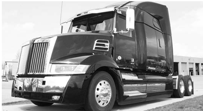
New '17 Western Star 5700XE , DD15, 505 hp, 13 spd., air ride, all alum. whls., 242" WB, stk. #E17282, $134,683.