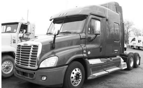
'13 FTL Cascadia, Cum. ISX, 450 hp, 10 spd. manual, 72" mid-roof slpr., stk. #UT7038, $45,000.