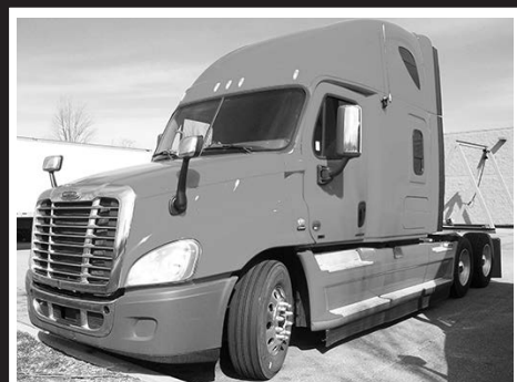
'12 FTL Cascadia, Det. DD15, 475 hp, 10 spd. manual, 72" R.R. slpr., stk. #UT7016, $42,500.