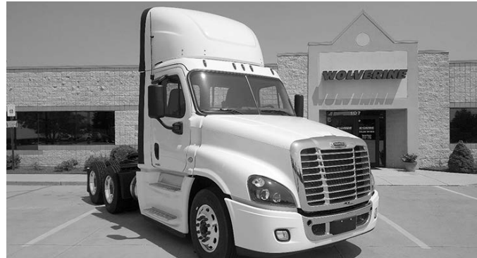
New '18 FTL Cascadia day cab, Evolution Aerodynamic pkg. , DD15, 400 hp, Det. D12 trans., 2.41 ratio, 52,000 GVW, air slide 5th, dual 80-gal. fuel tanks, alum. whls., stk. #W18023.