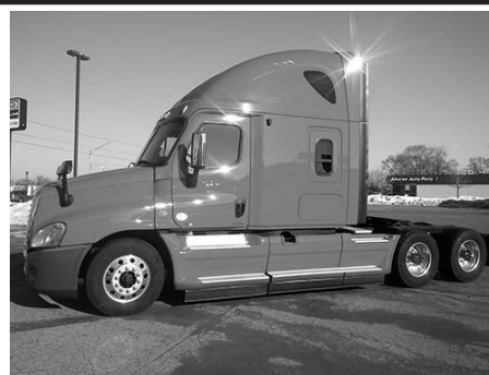
'12 FTL Cascadia, DD15, 475 hp, 10 spd., air ride, alum. whls., 225" WB, 3.08 ratio, 72" raised roof slpr., stk. #UT5609.