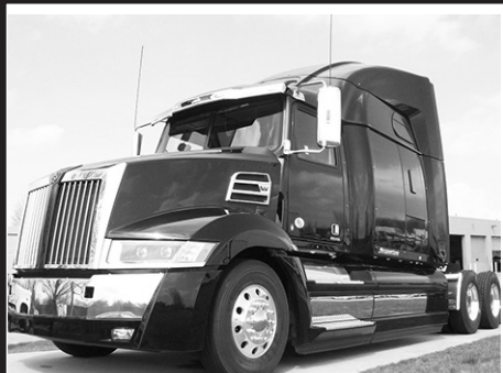
New '17 Western Star 5700XE , DD15, 505 hp, 13 spd., air ride, all alum. whls., 242" WB, stk. #E17282, $134,683.