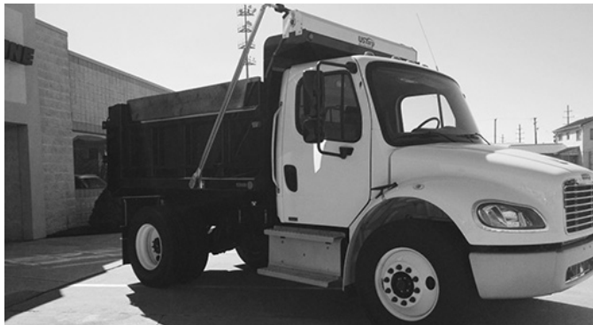
New '18 FTL M2-106 under CDL dump truck, Cum. ISB, 220 hp, Allison 2500RDS auto., Galion dump body, stk. #E18012, $82,500.

Wolverine Truck Group is your source for hardworking heavy duty trucks! Freightliner & Western Star models in stock & ready to work! Call for specs & details!