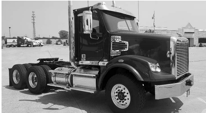
New '17 FTL 122-SD , DD15, 560 hp, 18 spd., 18F, 46R, Meritor air disc brakes, 3.91 ratio, air slide 5th, 140-gal. fuel, 60-gal. hyd., alum. whls., stk. #W17100.