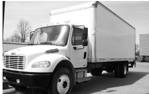
'07 FTL M2-106, Cat C7, 220 hp, auto., 24' box van, tuck-away liftgate, stk. #UT7024, $15,000.