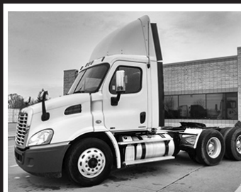
'11 FTL Cascadia day cab , DD13, 435 hp, 10 spd. manual, air ride, alum. whls., stk. #UT7037, $39,500.