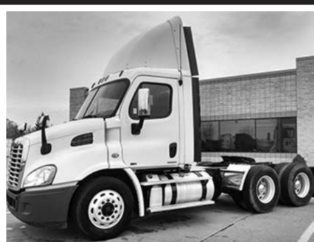
'11 FTL Cascadia day cab, DD13, 435 hp, 10 spd. manual, air ride, alum. whls., stk. #UT7037, $39,500.