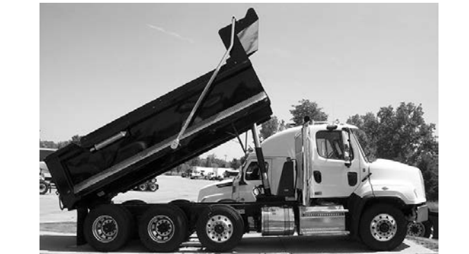
New '18 FTL 114SD tri-axle dump , DD13, 370 hp, 216" WB, 18F, 46R, 4.10 ratio, 77,200 GVW, Godwin dump body, stk. #W18024.