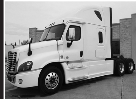
New '18 FTL Cascadia Evolution , DD15, 505 hp, 13 spd., 72" R.R. slpr., stk. #W18021, $118,051.