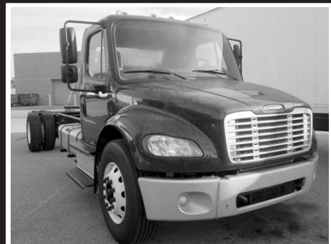
'13 FTL Business Class M2 106, ISB Cum., 240 hp, auto., trans., 234" WB, 10F, 17.5R, std. cab, stk. #UT5661, starting at $29,500.