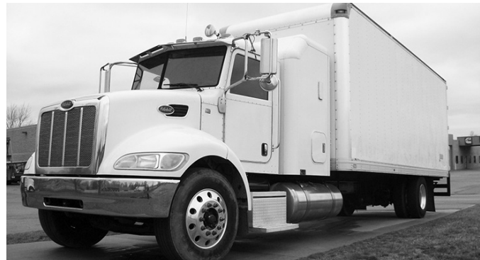
'11 Pete 337 Expedito truck, Paccar eng., 6 spd. manual, 48" slpr., stk. #UT7038, $35,000.