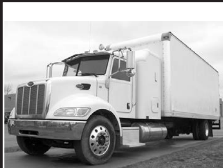
'11 Pete 337 Expeditor, Cum. dsl., 33,000 GVW, 48" slpr., 488,000 miles, ready to work!