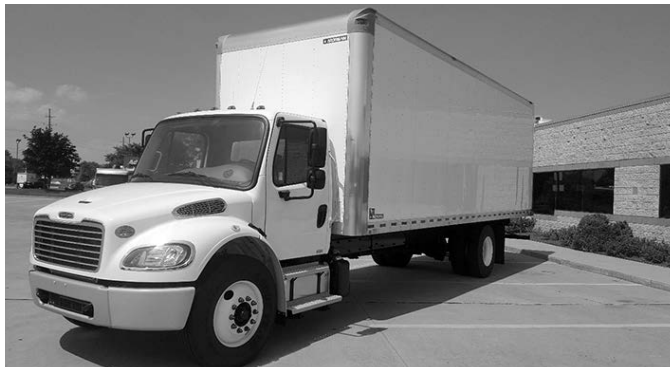
New '18 M2 106 van body , DD5, 230 hp, Allison auto, UNDER CDL , 26,000 GVW, air ride, 5.56 ratio, air brakes, 50-gal. fuel tank, 26' Morgan alum. van body, 103"x102" translucent roof, R.U. door, 12" dock ext., (2) rows E-Track, stk. #E18088.