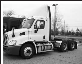
'11 FTL Cascadia day cab , Det. DD13, 435 hp, 10 spd. manual, air ride, 170" WB, $39,500.