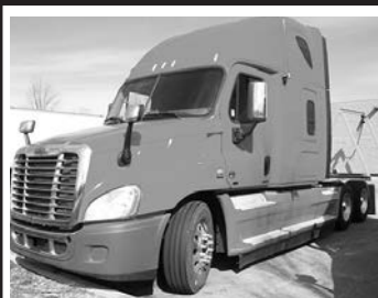
'12 FTL Cascadia , Det. DD15, 475 hp, 10 spd. manual, 72" R.R. slpr., $42,500.