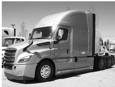
The NEW Cascadia! '18 FTL Cascadia Aero-X , DD15, DT12 trans., fuel economy pwr. train, stk. #W18001, call for details.