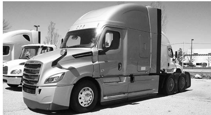
The NEW Cascadia! '18 FTL Cascadia Aero-X , DD15, DT12 trans., fuel economy pwr. train, stk. #W18001, call for details.