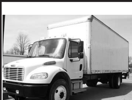
'07 FTL M2-106, Cat C7, 220 hp, auto., 24' box van, tuck-away liftgate, stk. #UT7024, $15,000.